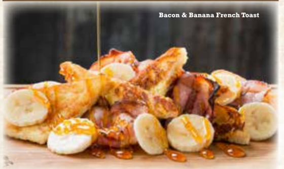
Bacon & Banana French Toast

CHICKEN MAYONNAISE 42.90 CHEESE AND TOMATO 42.90 BACON, CHEESE AND EGG 52.90