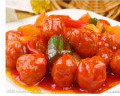
Sweet&Sour pork ---R70