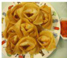
Fried won ton 8pcs----R48