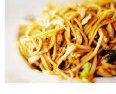
Veg Chow Mein - R60