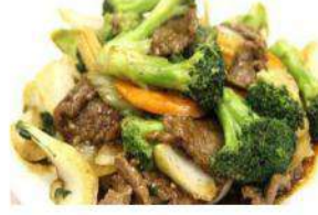
ChopSuey Beef ----R88