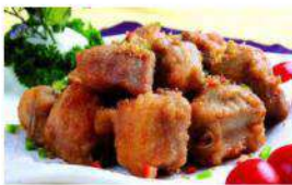
Salt&Pepper ribs ----R88