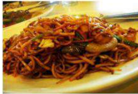
Beef Chow Mein -----78