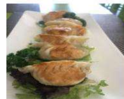
Dumplings(8pcs) Chicken/Pork----R58 Veg-----R52