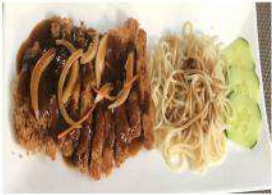
BBQ Beef ---R 98