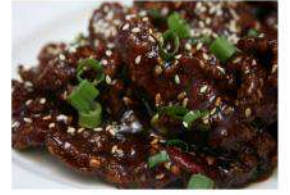
Crispy Beef ----R88