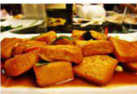
Tofo stir-fry -----R78