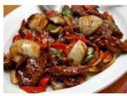
Black pepper --R88