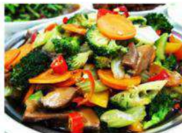
Veg chop suey -R65