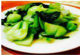
Seasonal Vegetable -R68