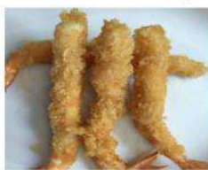
Prawn Tempure 4pcs-----R48 Crabsticks Tempure--R38