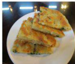
Springonion pan cakeR30