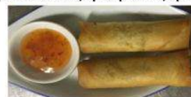
(2pcs chicken ,2pcs prawn,2pcs chocolate,2pcs vegetable)