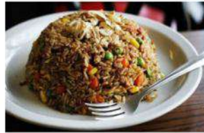
Beef Rice -----R78