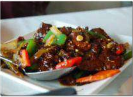
Black bean Beef ---R88