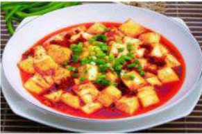
Ma po Tofu -----92