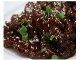
Crispy Pork ----R88