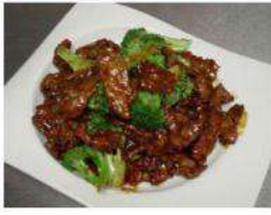
Oyster Beef --R88