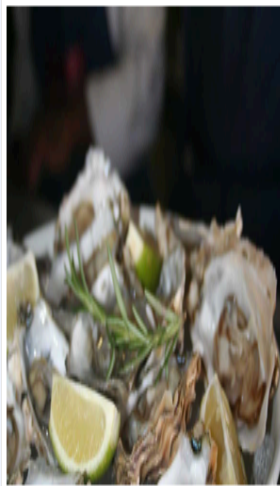
Fresh Knysna Oysters