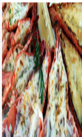
Grilled Shellfish Platter