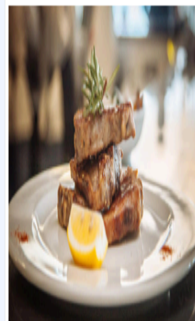
Grilled Lamb Chops