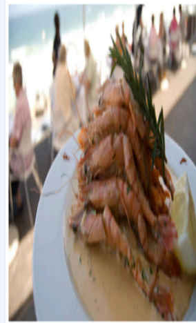
Grilled Queen Prawns