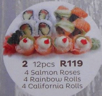
2 12pcs R119 4 Salmon Roses 4 Rainbow Rolls 4 California Rolls