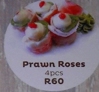
Prawn Roses 4pcs R60