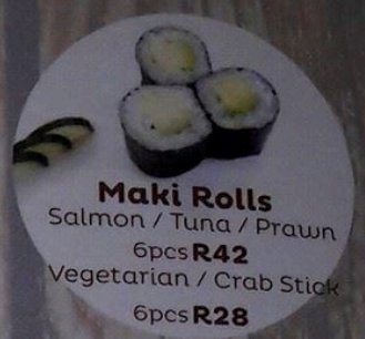
Maki Rolls Salmon / Tuna / Prawn 6pcs R42 Vegetarian / Crab Stick 6pcs R28