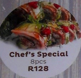
Chef's Special 8pcs R128