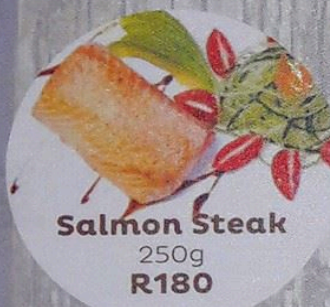
Salmon Steak 250g R180