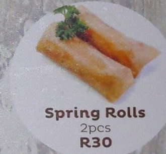
Spring Rolls 2pcs R30