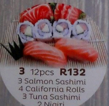
3 12pcs R132 3 Salmon Sashimi 4 California Rolls 3 Tuna Sashimi 2 Nigiri