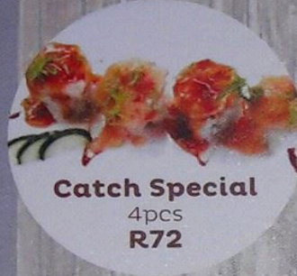
Catch Special 4pcs R72