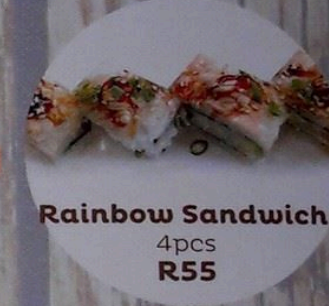
Rainbow Sandwich 4pcs R55