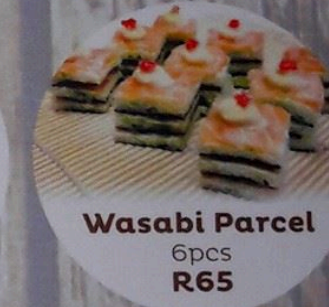
Wasabi Parcel 6pcs R65