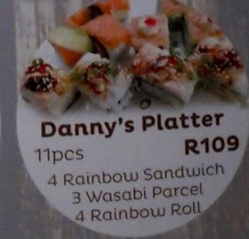
Danny's Platter 11pcs R109 4 Rainbow Sandwich 3 Wasabi Parcel 4 Rainbow Roll