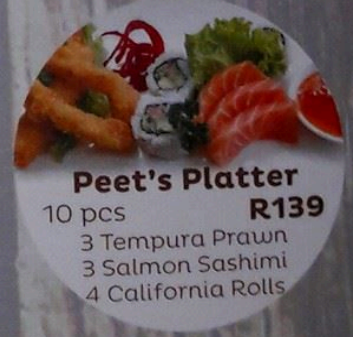
Peet's Platter 10 pcs R139 3 Tempura Prawn 3 Salmon Sashimi 4 California Rolls