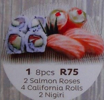
1 8pcs R75 2 Salmon Roses 4 California Rolls 2 Nigiri