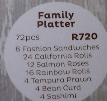
Family Platter 72pcs R720 8 Fashion Sandwiches 24 California Rolls 12 Salmon Roses 16 Rainbow Rolls 4 Tempura Prawn 4 Bean Curd 4 Sashimi