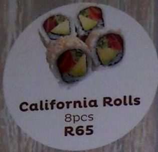
California Rolls 8pcs R65