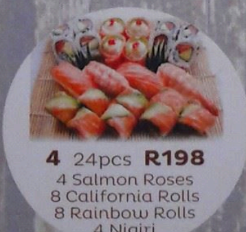
4 24pcs R198 4 Salmon Roses 8 California Rolls 8 Rainbow Rolls 4 Nigiri