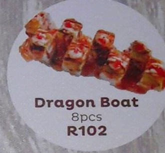
Dragon Boat 8pcs R102