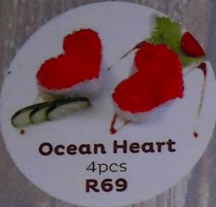
Ocean Heart 4pcs R69