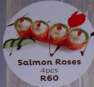
Salmon Roses 4pcs R60