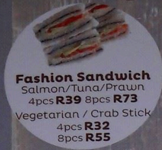
Fashion Sandwich Salmon/Tuna/Prawn 4pcs R39 8pcs R73 Vegetarian / Crab Stick 4pcs R32 8pcs R55