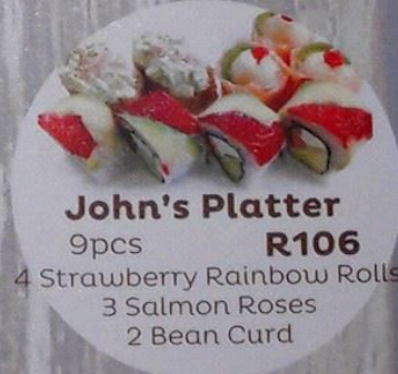
John's Platter 9pcs R106 4 Strawberry Rainbow Rolls 3 Salmon Roses 2 Bean Curd