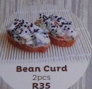
Bean Curd 2pcs R35