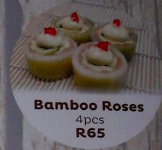
Bamboo Roses 4pcs R65