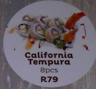
California Tempura 8pcs R79