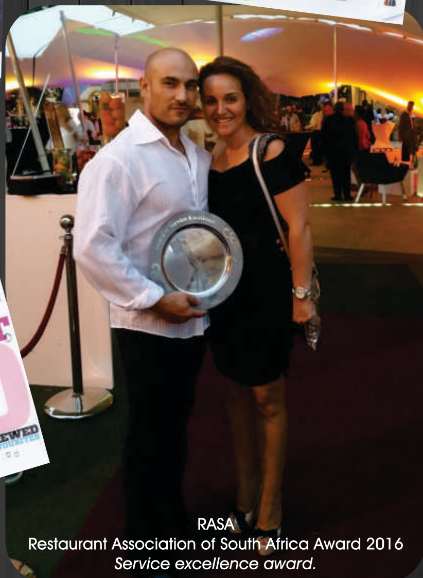
RASA Restaurant Association of South Africa Award 2016 Service excellence award.