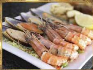
Seafood Platter - Fuente 270

3 Pieces of chicken, crumbed and fried, served with putu pap, Fuego salsa, pico ensalada and sweet butternut