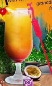
Cuban Hoover 39

Our blend of Havana Club Blanco Rum, vodka with sweet orange & granadilla fruits