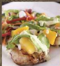
Santa Clara 70

Nacho crumbed chicken fillets, deep fried, topped with melted mozzarella, slices of pickled jalapeños, cream cheese and pico ensalada