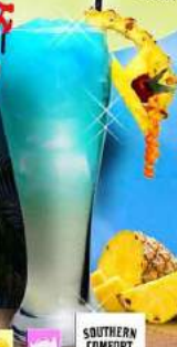
Tasmanian Devil 50

This Cocktail has taken SA by storm. SoCo, Apple Sours, Peach, pineapple juice topped with a citrus blue crush