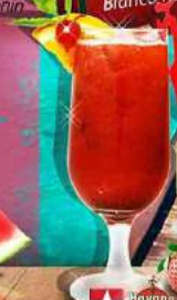
Groovy Cuban 39

For the love of strawberries. Cranberry Sours & strawberry juice infused with Havana Club Blanco Rum & lemonade