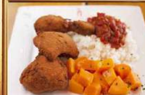
Southern Fried 70

Grilled chicken fillets topped with butternut, rocket, feta and drizzled with creamy lemon sauce. Recommended with salad of the day