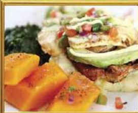
Bermuda Triangle 80

Kingklip grilled with lemon, garlic and herb butter. Served with garlic sauce and pico ensalada