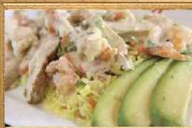
Pollo Gambas 155

Tender calamari rings, crumbed and deep fried, served with a spring onion lemon mayo and a side of your choice