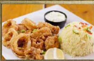
Crumbed Calamari 100

Tender calamari rings, crumbed and deep fried, served with a spring onion lemon mayo and a side of your choice