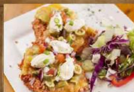
Key Largo 90

All dishes served with either fries, rice, mashed potato, polenta squares, veggies or salad