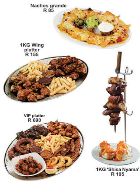
Nachos grande R 85