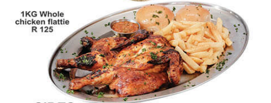
1KG Whole chicken flattie R 125