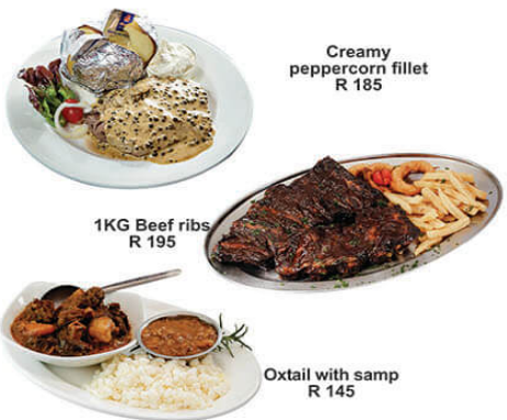
Creamy peppercorn fillet R 185