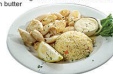
Calamari grilled R 95