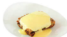
Malva pudding R 60