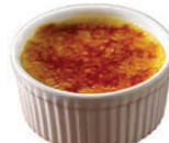
Crème brûlée R 65