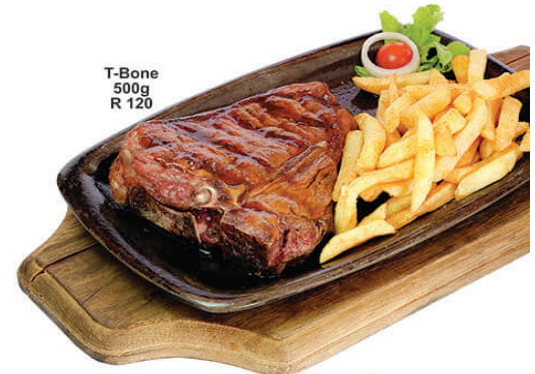
T-Bone 500g R 120