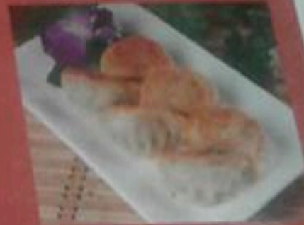
Fried Dumplings (6pcs) R30