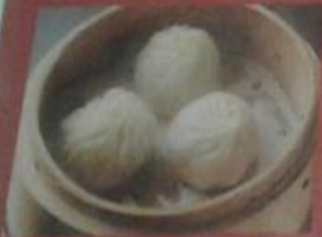
Small Steamed Pork Bun (3pcs) R32