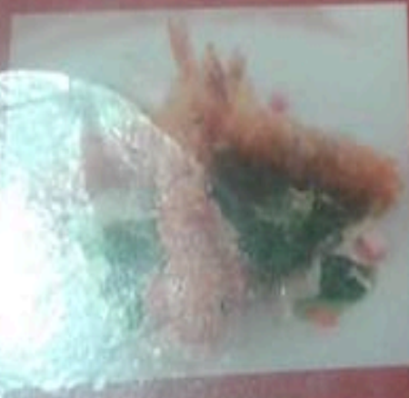
Prawn Tempura (3pcs) R45