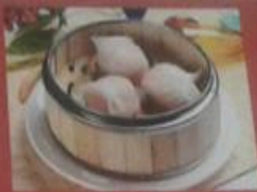
Prawn Dumplings (3pcs) R48