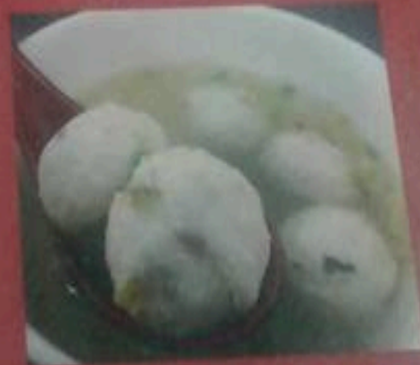
Fish Meat Ball R45