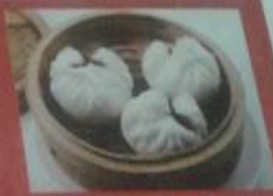
Roasted Pork Bun (3pcs) R32