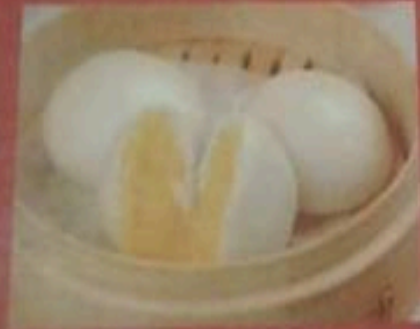
Custard Bun (3pcs) R35