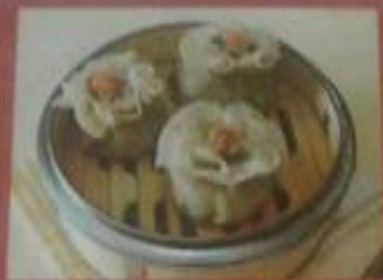
Shaomai (3pcs) R35