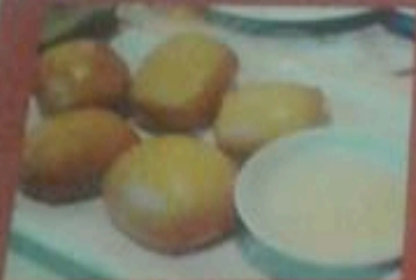
Golden Fried Small Bread (4pcs) R25