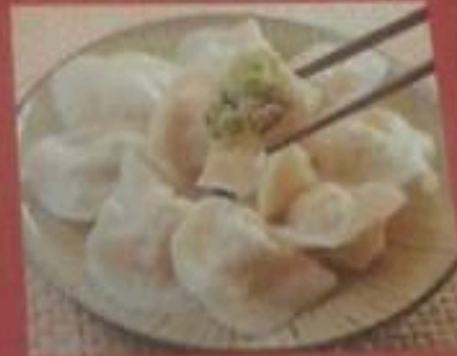
Boiled Dumplings (6pcs) R30