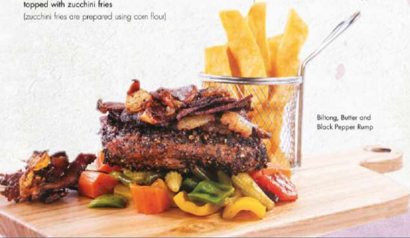
Biltong, Butter and Black Pepper Rump