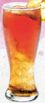
Long Island Iced Tea