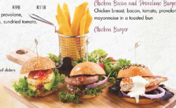
Trio of sliders

✓ Three Cheese Pizza R98 R118 Tomato base, mozzarella, provolone, gouda, caramelized onion, sundried tomato, chilli and fresh rocket