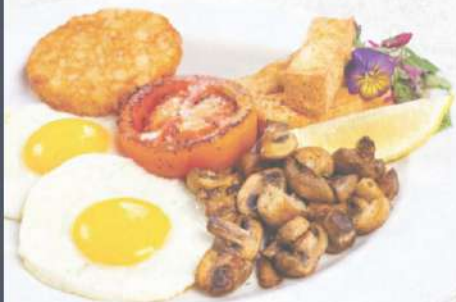
Fried Haloumi Breakfast

Fried Haloumi Breakfast R95 2 eggs, grilled tomato, sautéed mushrooms, hash brown, and fried haloumi cheese