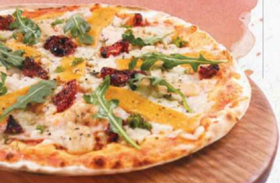
Vegan Three Cheese Pizza

✓ The Pepper R88 R108 Tomato base, roasted peppers, peppadews, jalapeño chilli, sundried tomato and feta cheese