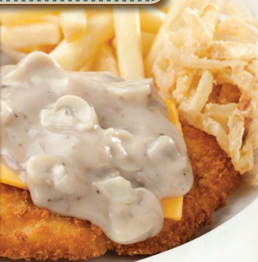
Chicken Cheddarmelt Schnitzel