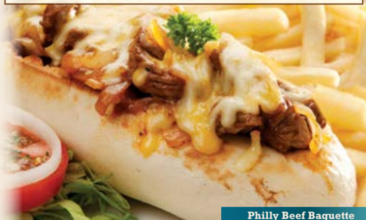
Philly Beef Baguette