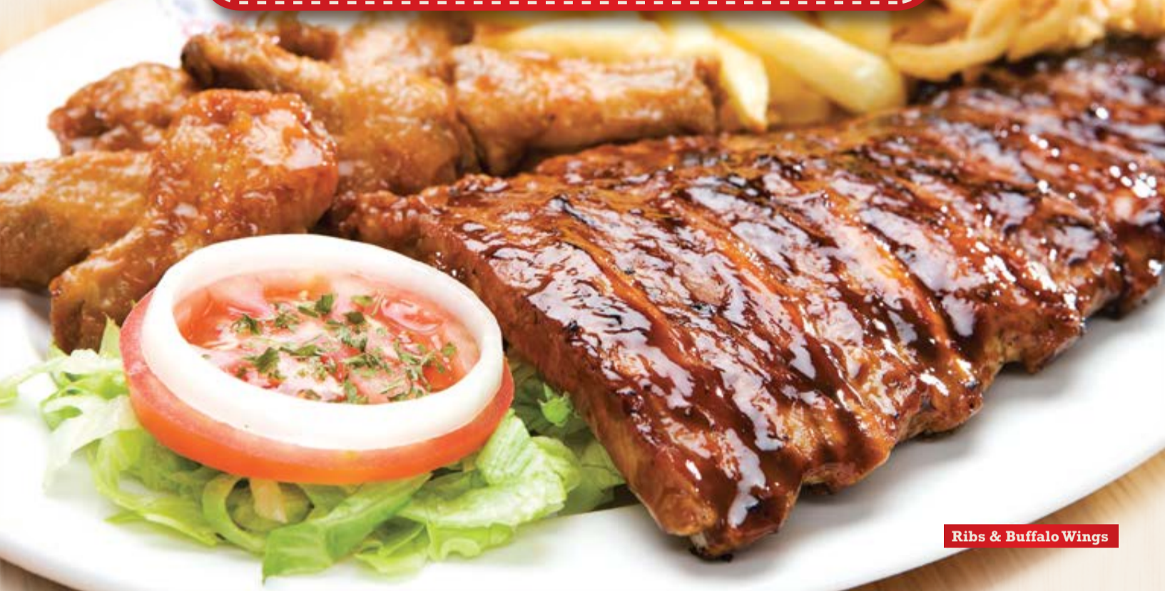
Ribs & Buffalo Wings