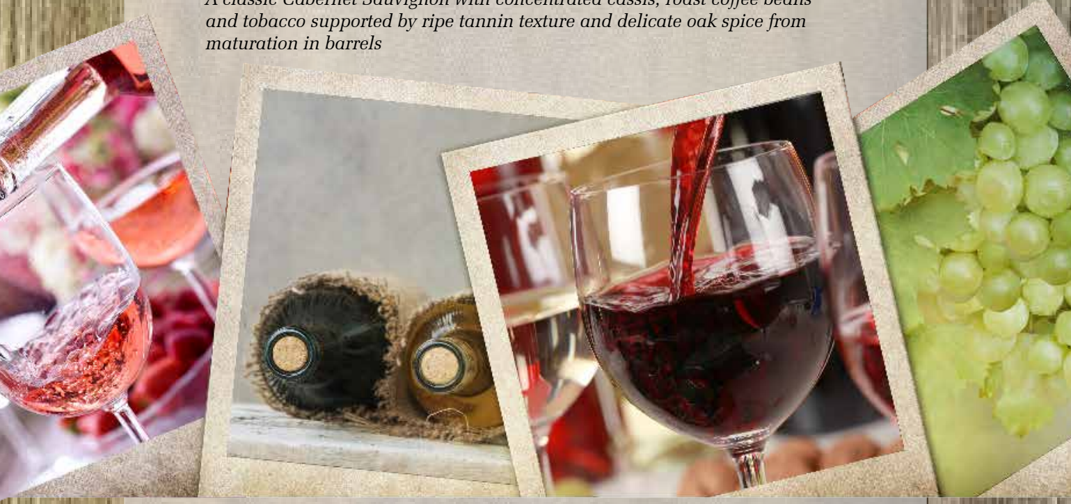
All prices are vat inclusive. Right of admission is reserved. A 10% service fee will be added to parties of 8 or more persons. Please take note that all meals are freshly prepared and therefore will take 20-40 minutes.

A classic Cabernet Sauvignon with concentrated cassis, roast coffee beans and tobacco supported by ripe tannin texture and delicate oak spice from