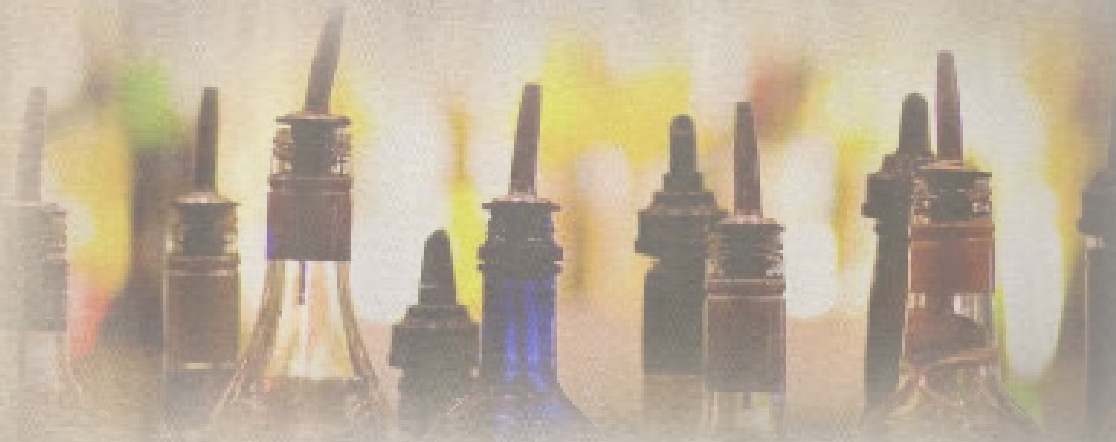
All prices are vat inclusive. Right of admission is reserved. A 10% service fee will be added to parties of 8 or more persons. Please take note that all meals are freshly prepared and therefore will take 20-40 minutes.