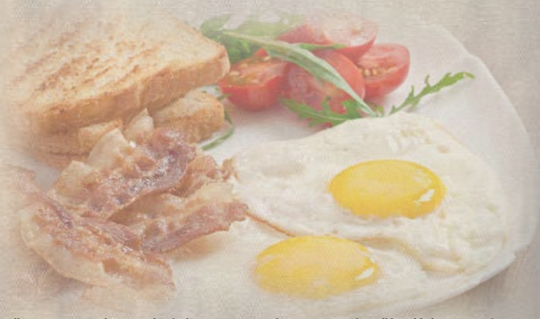
All prices are vat inclusive. Right of admission is reserved. A 10% service fee will be added to parties of 8 or more persons. Please take note that all meals are freshly prepared and therefore will take 20-40 minutes.

Bacon | Egg | Mushroom | Cheese Pork Sausage | Beef Sausage