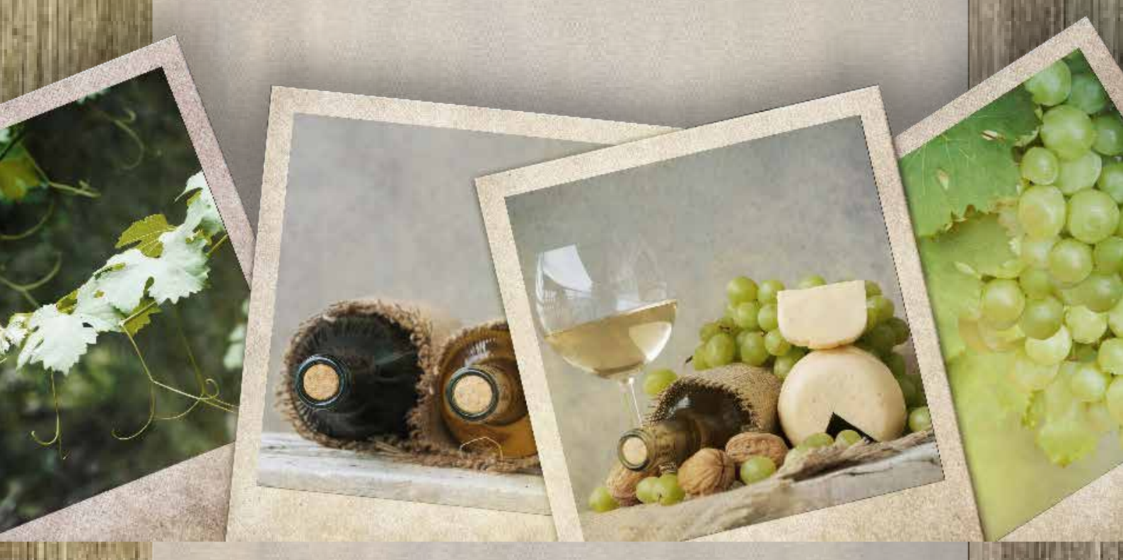
All prices are vat inclusive. Right of admission is reserved. A 10% service fee will be added to parties of 8 or more persons. Please take note that all meals are freshly prepared and therefore will take 20-40 minutes.

Dainty and delicious unwooded Chardonnay with primary tropical pineapple, grapefruit and lemon and lime citrus fruit to shine uninterrupted.