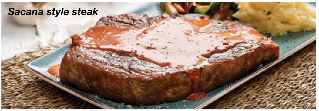
Sacana style steak