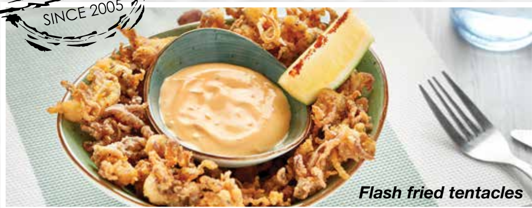
Flash fried tentacles