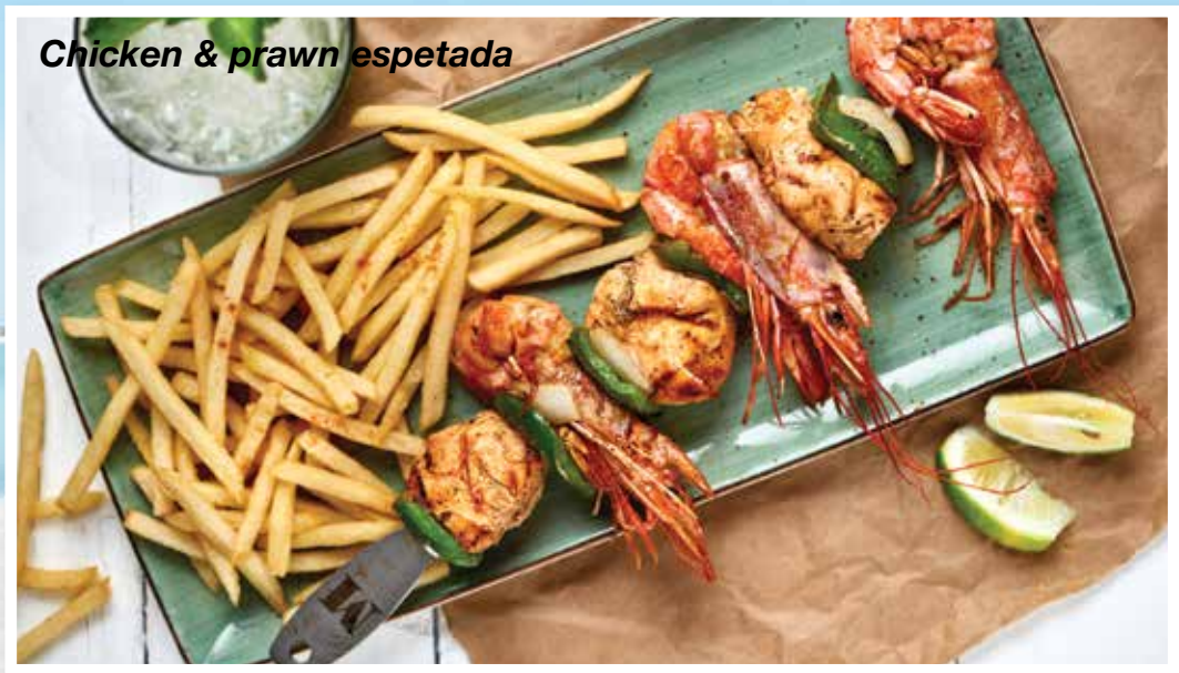
Chicken & prawn espetada