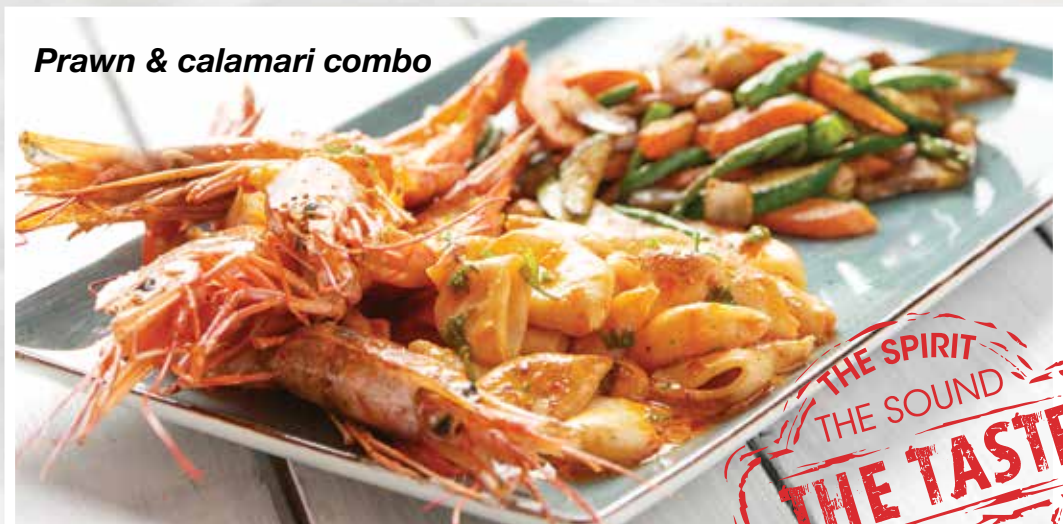
Prawn & calamari combo