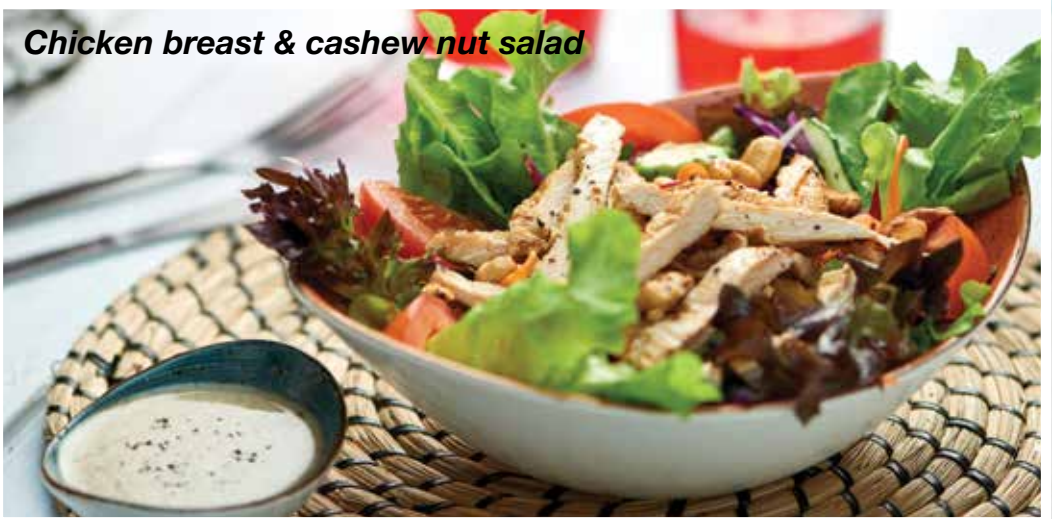
Chicken breast & cashew nut salad