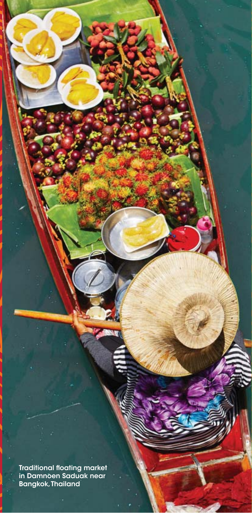
Traditional floating market in Damnoen Saduak near Bangkok, Thailand