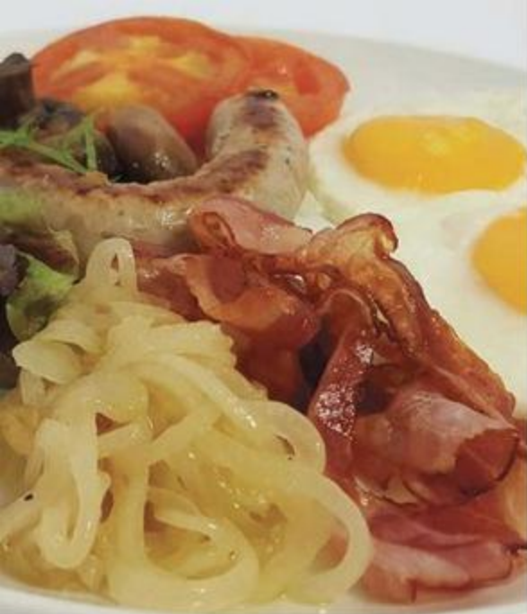
Craft Your Own: Basic Breakfast