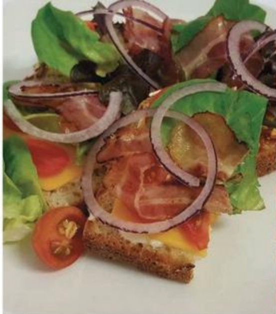
Bacon, Tomato & Cheese Open Sandwich