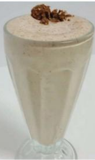
Ferrero Rocher Milkshake

"An Ice-Cold beverage is a magical and wondrous thing"