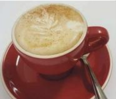
Cappuccino with foam

“Coffee, your most important meal of the day!”