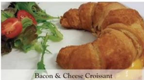
Bacon & Cheese Croissant