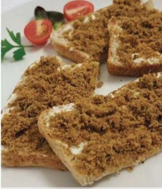
2 Slices of Toast with biltong powder