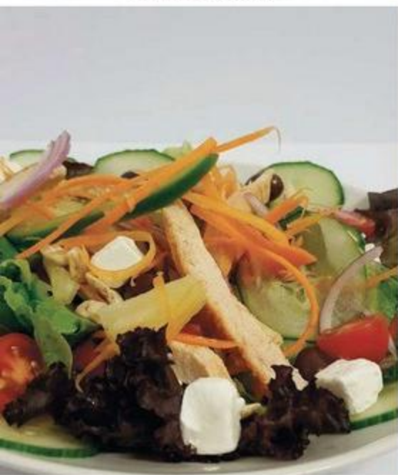
Tropical Chicken Salad