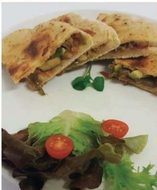
Roasted Vegetable Tramezzini