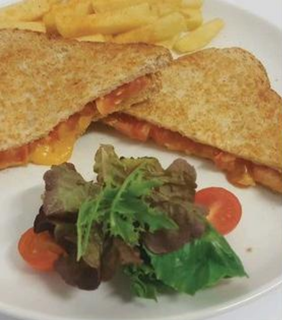
Ham, Cheese & Tomato Sandwich