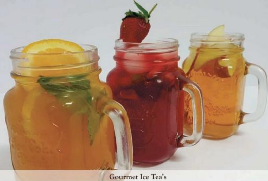
Gourmet Ice Tea's

"An Ice-Cold beverage is a magical and wondrous thing"