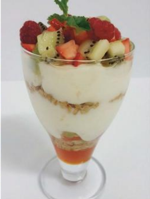
Yoghurt, Muesli & Fresh Fruit