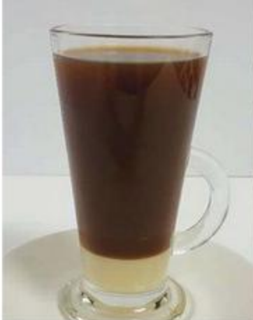
Upside Down Coffee