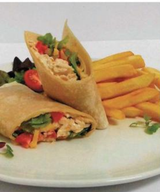
Chicken Mayo Wrap