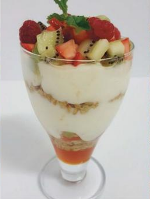
Yoghurt, Muesli & Fresh Fruit