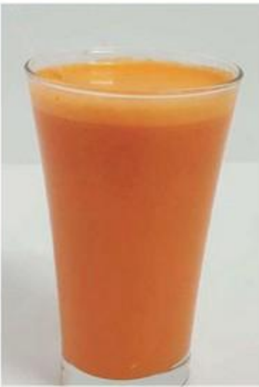
Carrot, Pineapple & Ginger Juice