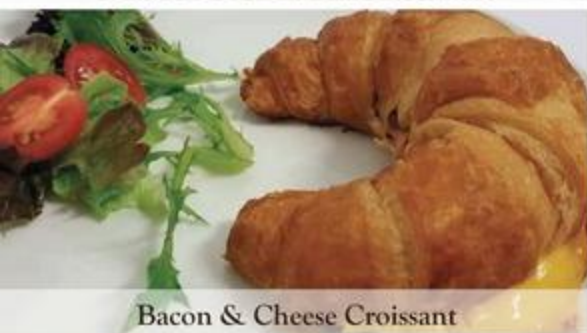
Bacon & Cheese Croissant