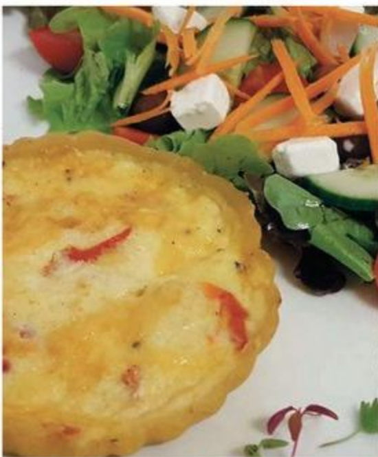
Quiche with Salad