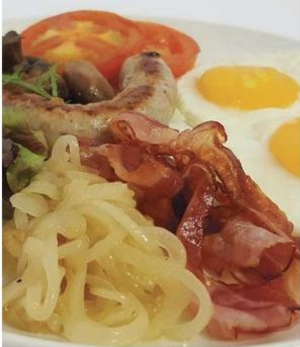
Craft Your Own: Basic Breakfast