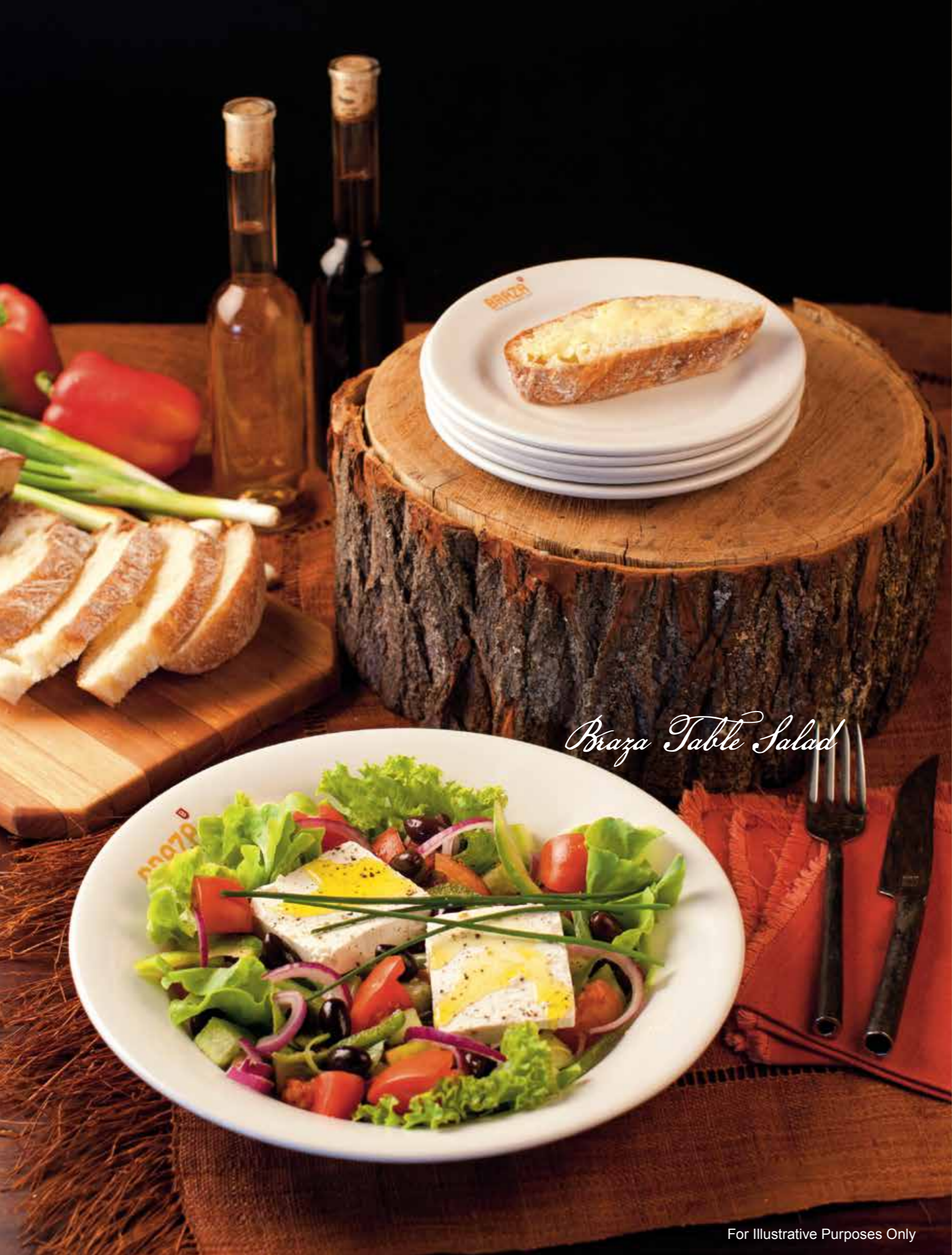
Braza Table Salad