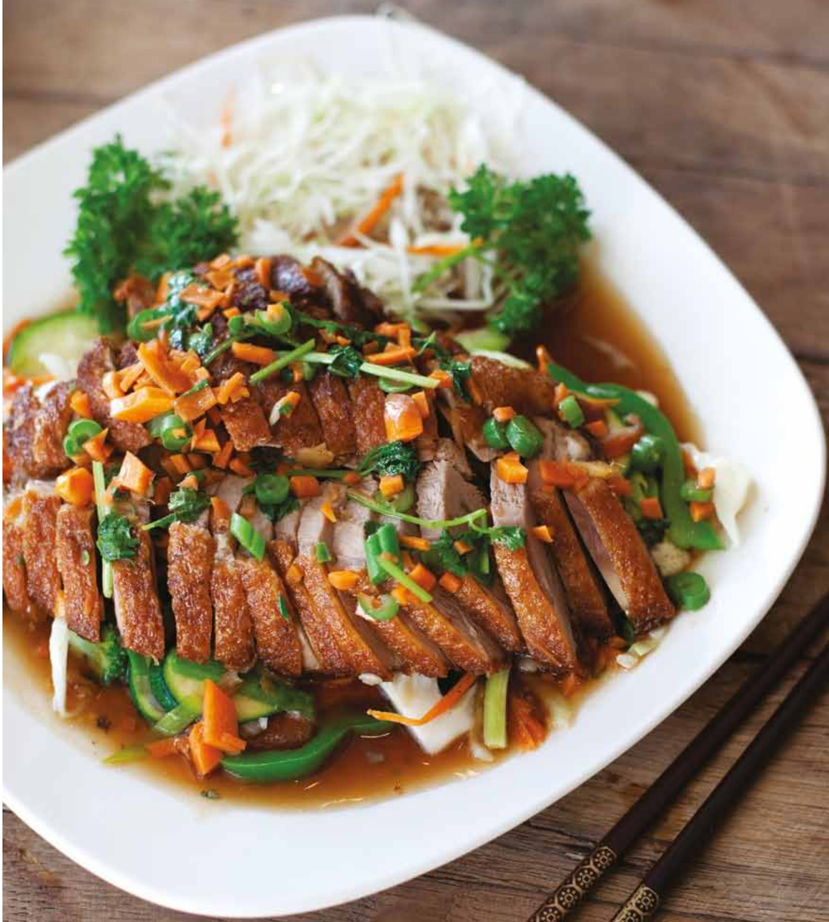
CHEF'S SPECIAL | Crispy Duck