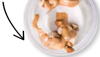
PEANUT BUTTER & BANANA ALMOND POT