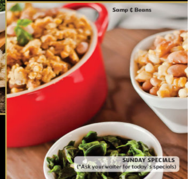
Samp & Beans

SUNDAY SPECIALS (*Ask your waiter for today's specials)