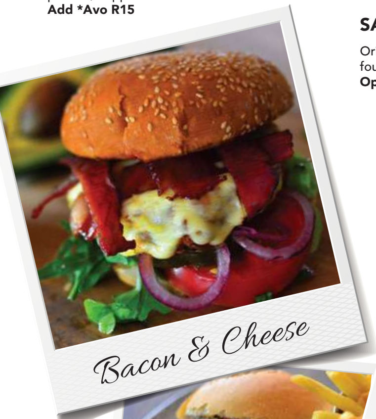
Bacon & Cheese

Options: Mushroom Sauce, Pepper Sauce, Cheese Sauce, Garlic Sauce