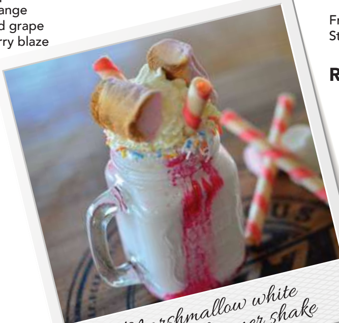
Marshmallow white chocolate designer shake