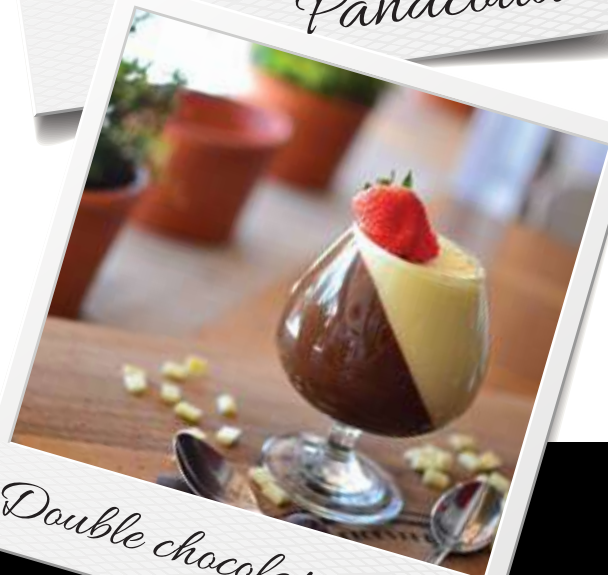
Double chocolate mousse

A service charge of 10% will be added to tables of 8 or more people. All our food may contain traces of nuts & garlic. All prices subject to change without prior notice. All menu pictures shown are for illustration purpose only.