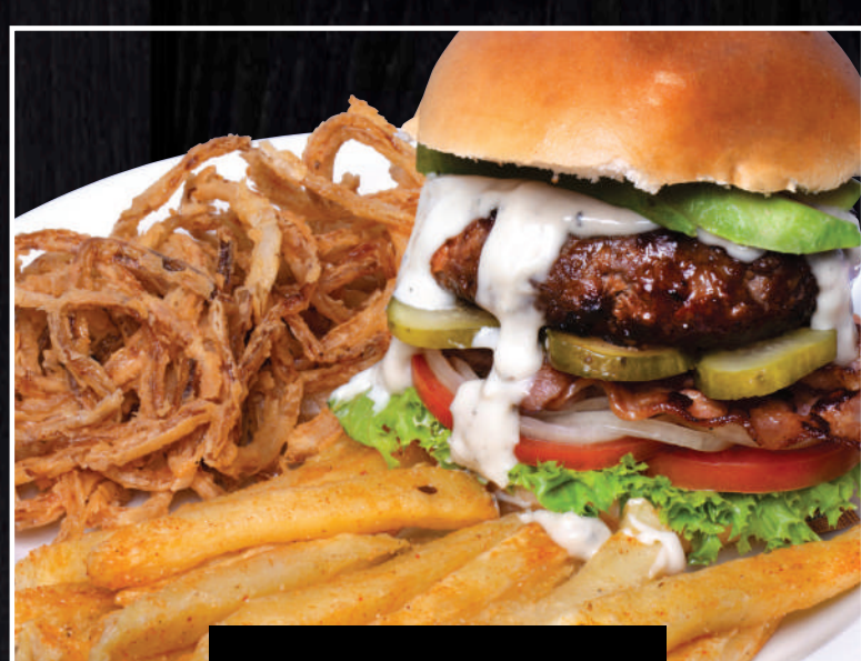
IN THE ZONE