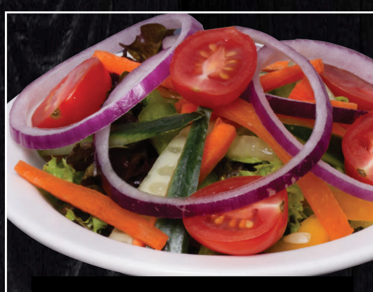
SIDES & SAUCES