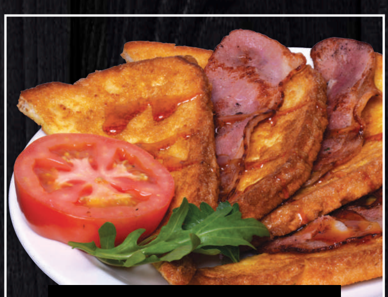
THE SANDWICH DELI