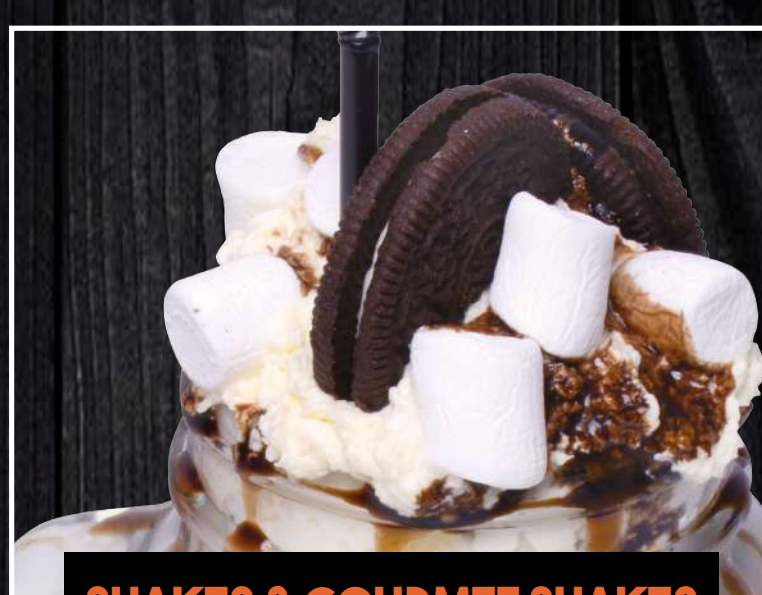
SHAKES & GOURMET SHAKES