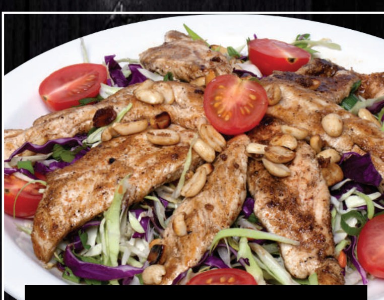
FRESH & CRISP SALADS