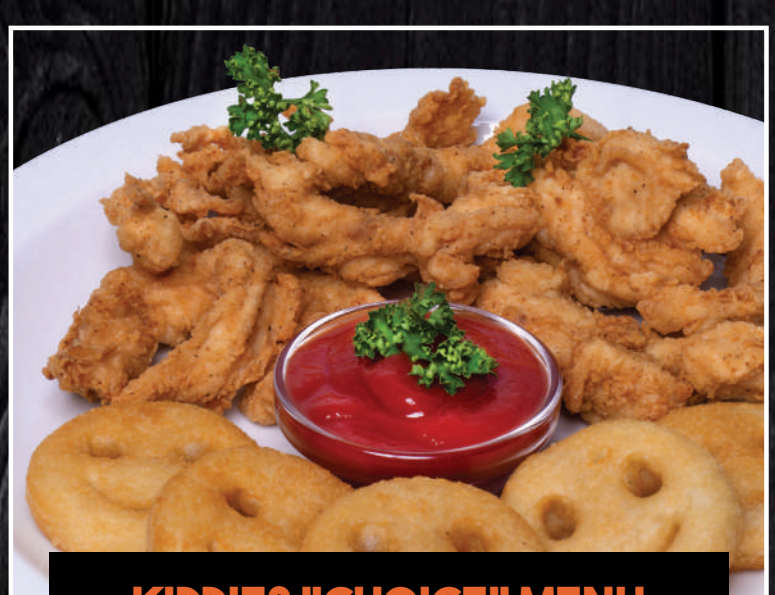
KIDDIES "CHOICE" MENU