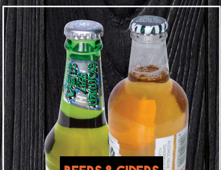
BEERS & CIDERS