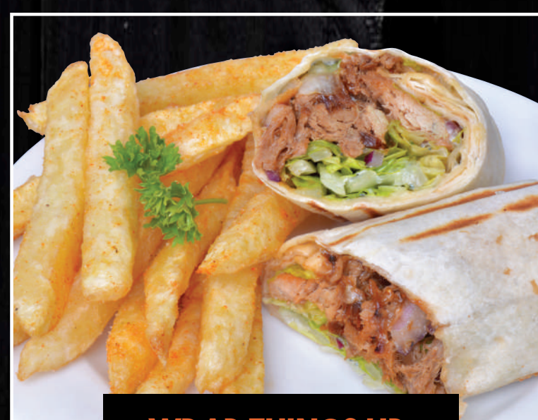
WRAP THINGS UP