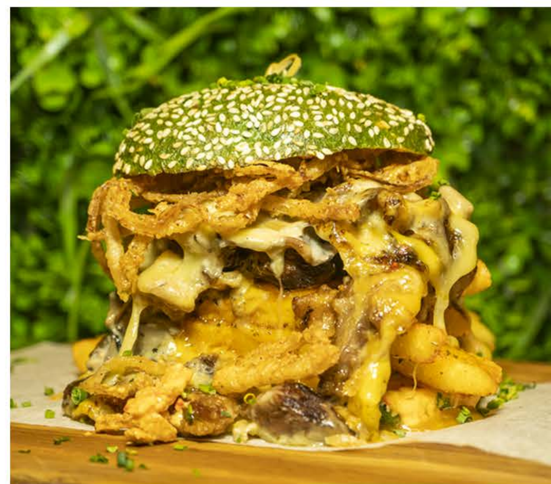
Beef Ripped burger R180 succulent pulled beef rib burger, CBD relish, wild mushroom sauce and topped with cheddar cheese