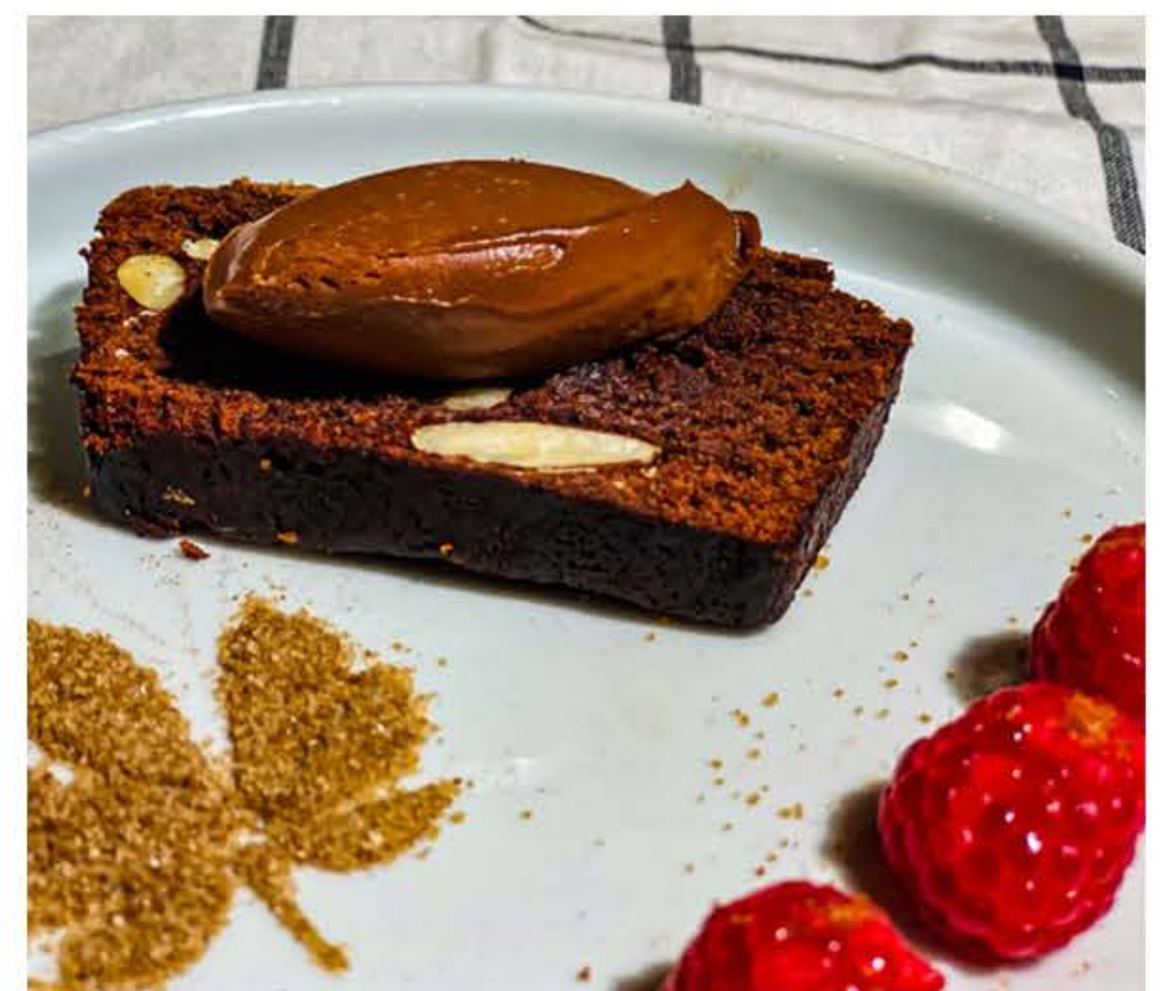
Space Cake R75 Chocolate death brownie