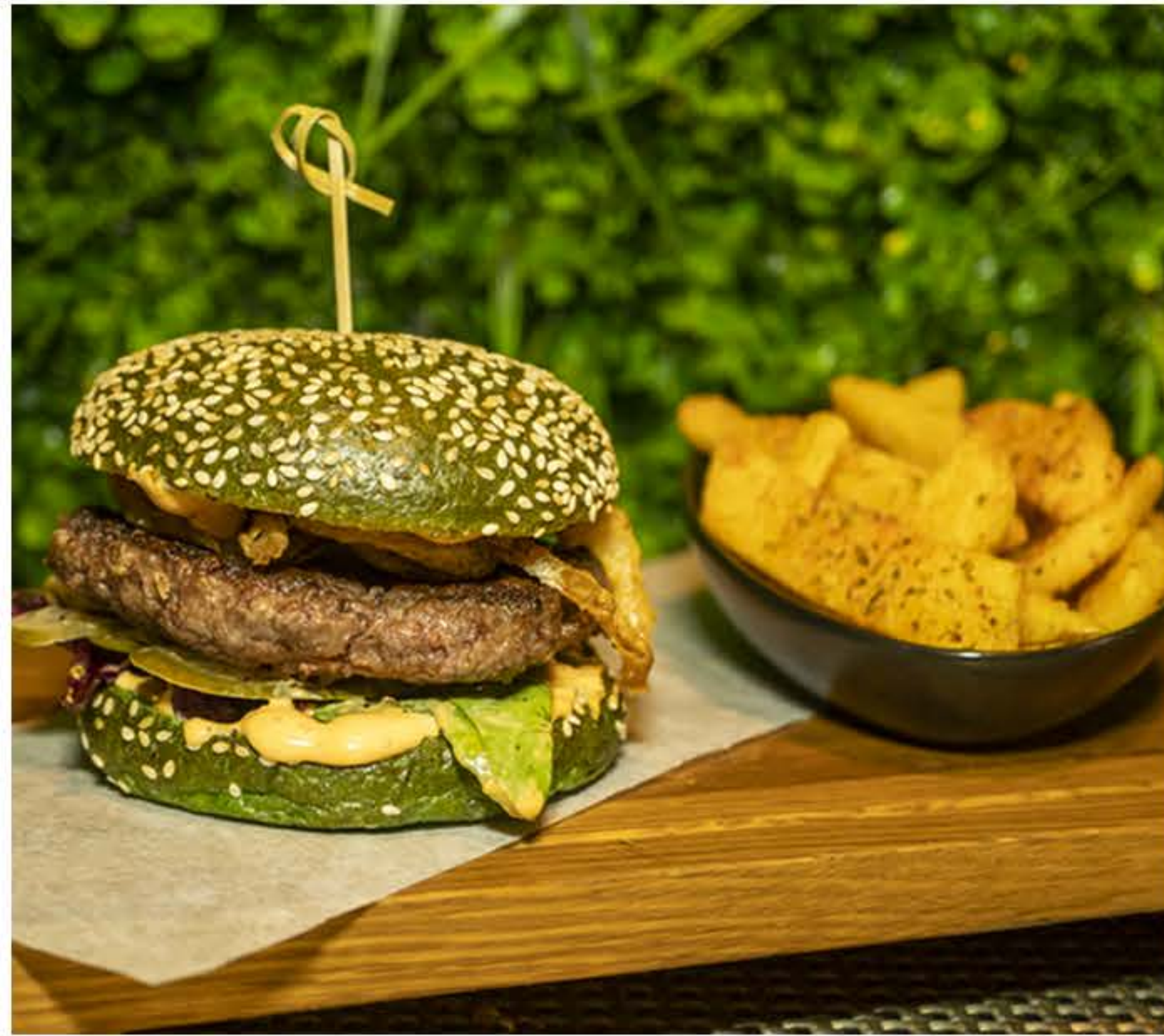
CBD original beef burger R95 180g burger with hand cut chips & onion rings

all of our burger buns are banting friendly (made with nut flour)