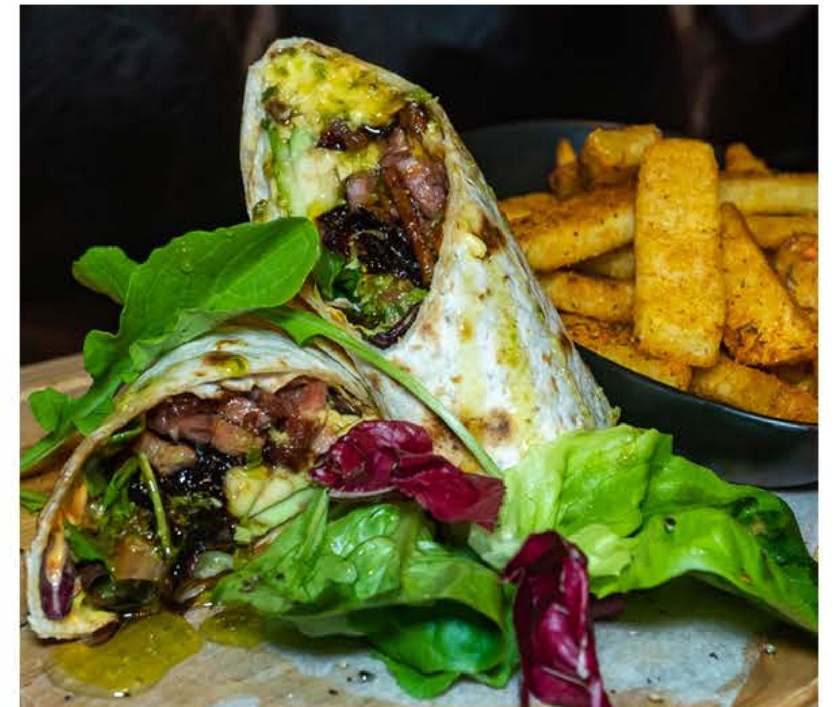
The Hogger R85

Chicken breast, Baby leaves mix, Fresh tomato Fresh avo, Caramelised onion Brie cheese 2 Eggs (scrambled) Tortilla wrap Served with rustic fries