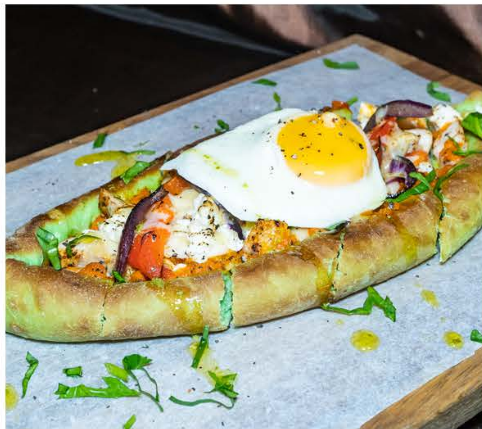
Super Jack R95

Honey-glazed pancetta, Portobello mushrooms Candied red onions, Sweet tomato sauce Mozzarella, Fried egg