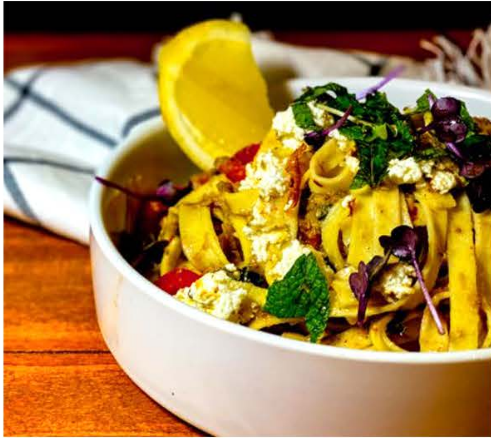
Hotbox Aubergine R95 caviar CBD pasta served grilled red peppers, olives, basil, smoked house ricotta