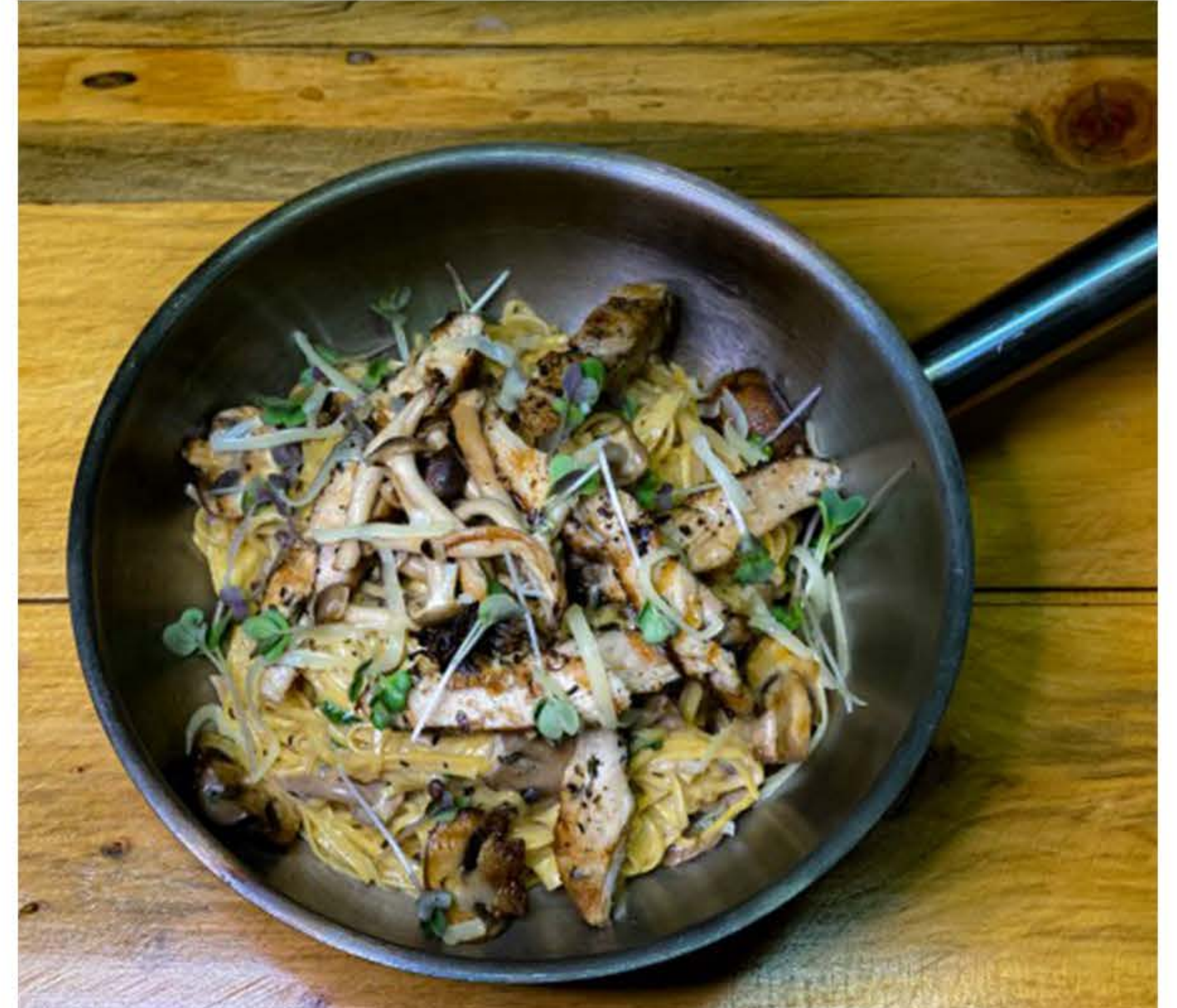
Fly High R150 Tender grilled chicken breast with a creamy wild mushroom, white wine, thyme & roasted garlic cream pasta