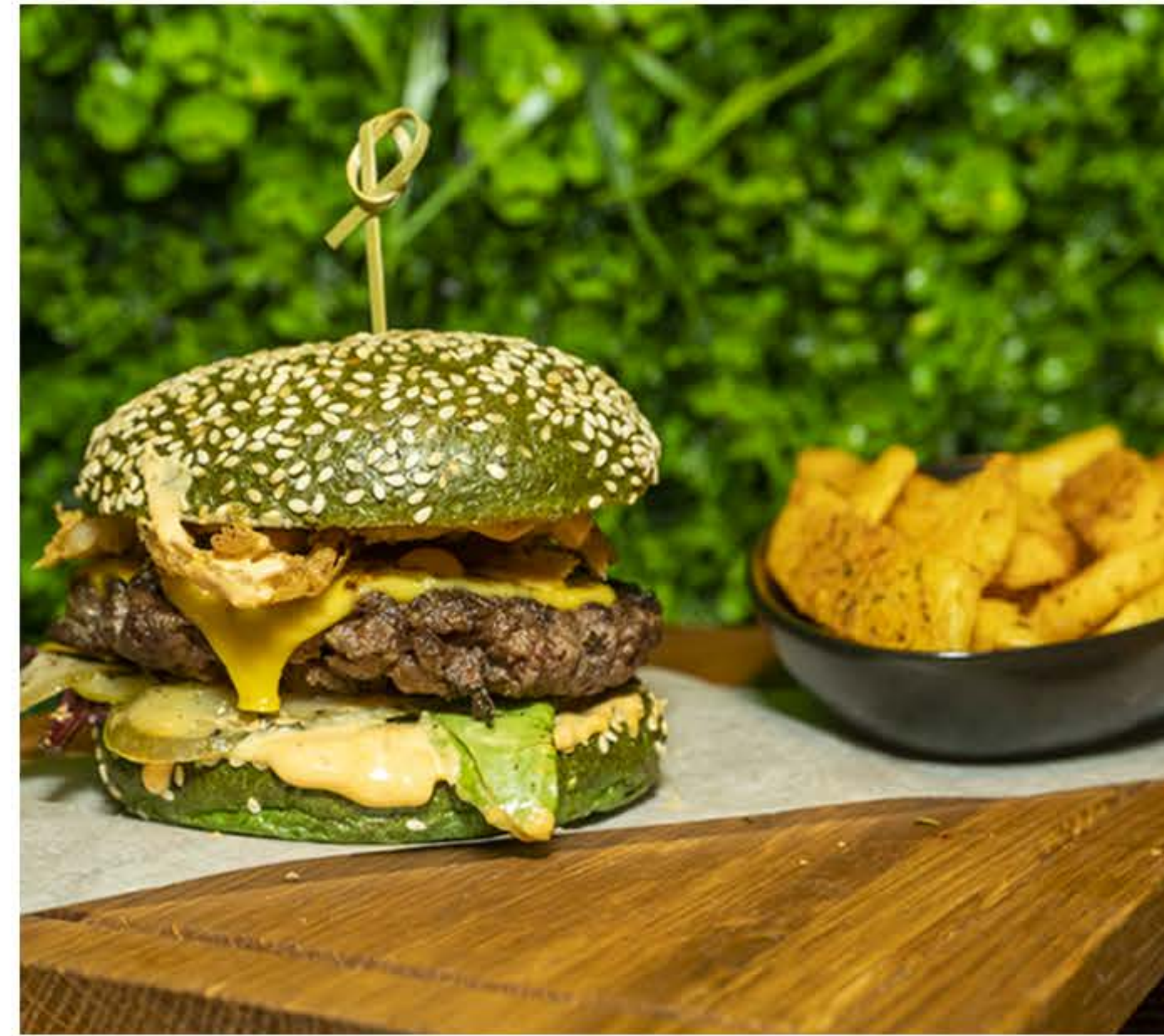
Cheese CBD original beef burger R100 180g burger with hand cut chips & onion rings