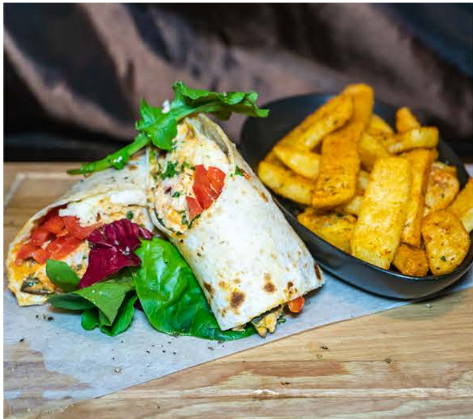
Blazing Blunt R85

Chicken breast, Sriracha mayo, Baby leaves mix Mozzarella Tortilla wrap Served with rustic fries