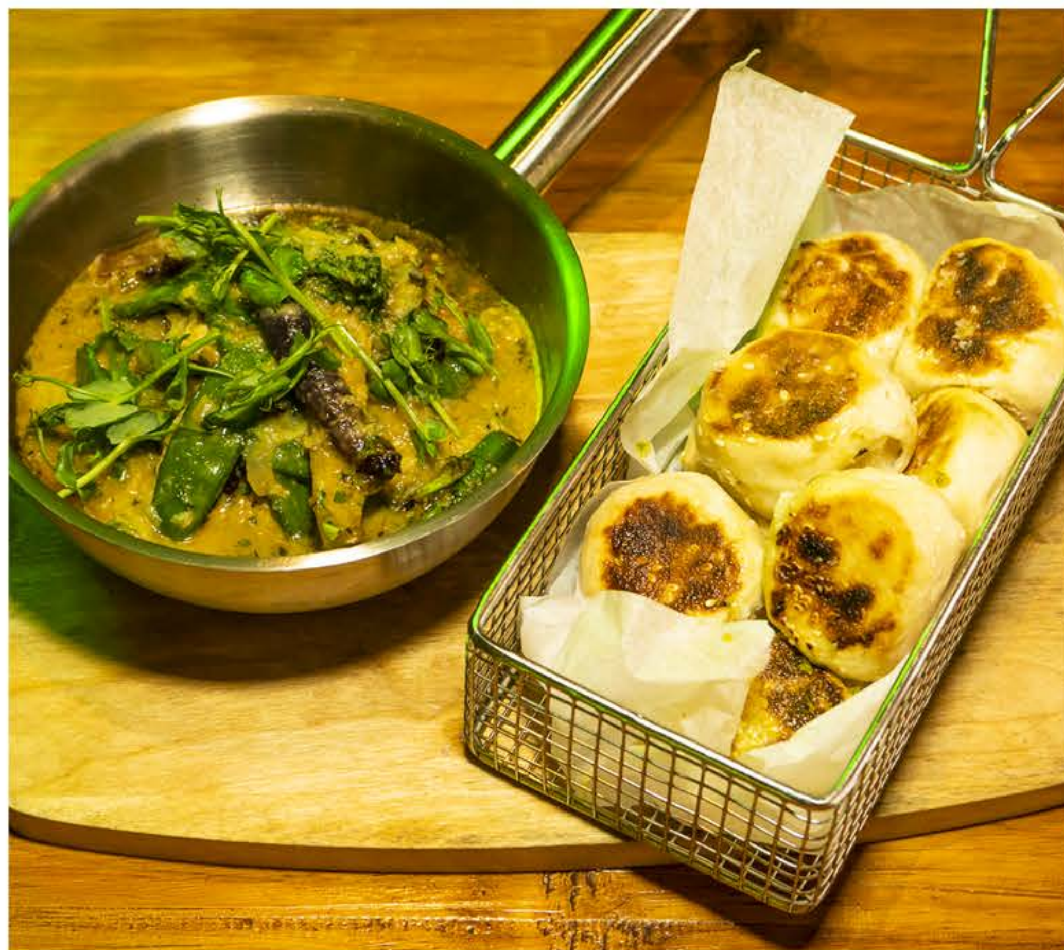
Thai-thunder CBD infused hearty Thai green curry Chicken R120 or Prawn R140

Fillet Sirloin -250g R160 -250g R110 -300g R190 -300g R120