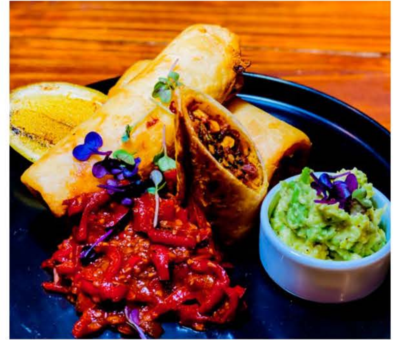
Hand-rolled Corn fried Mexican Taquitos R95 stuffed with beef con carne & a CBD grilled red pepper chutney