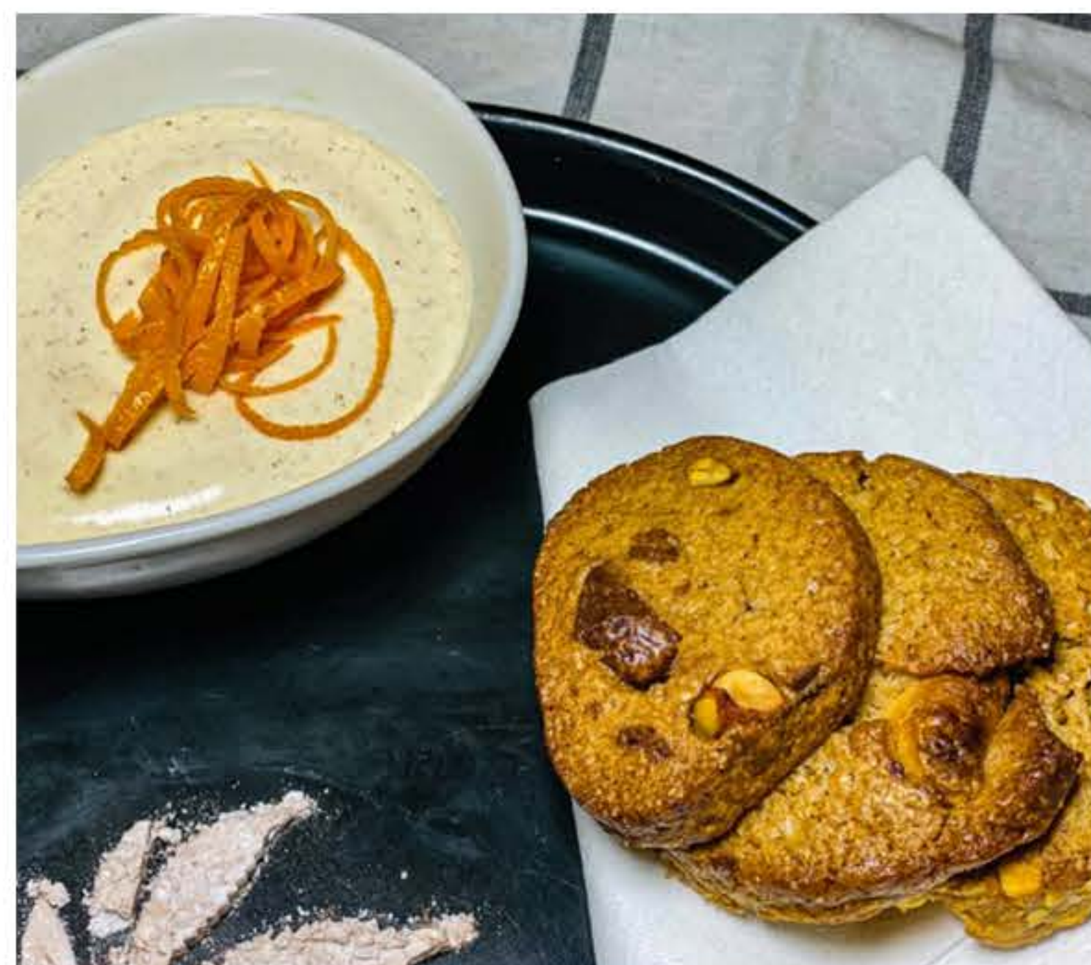
Cookies & Spicy Kush R68