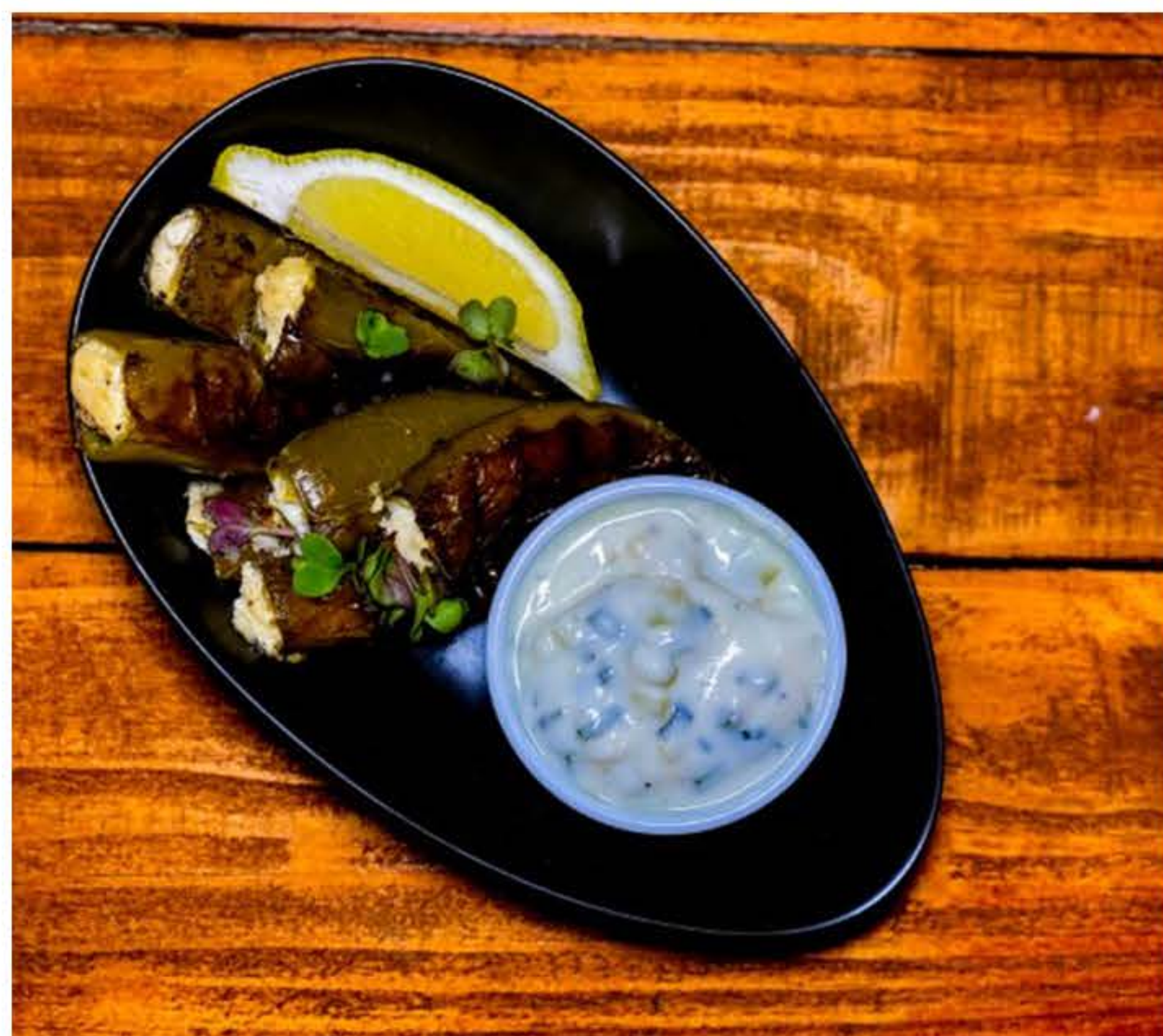
Smoked Jay Poppers R85 stuffed with CBD cream cheese in a hemp crumb OR smoked plain jay & a roasted garlic mayo