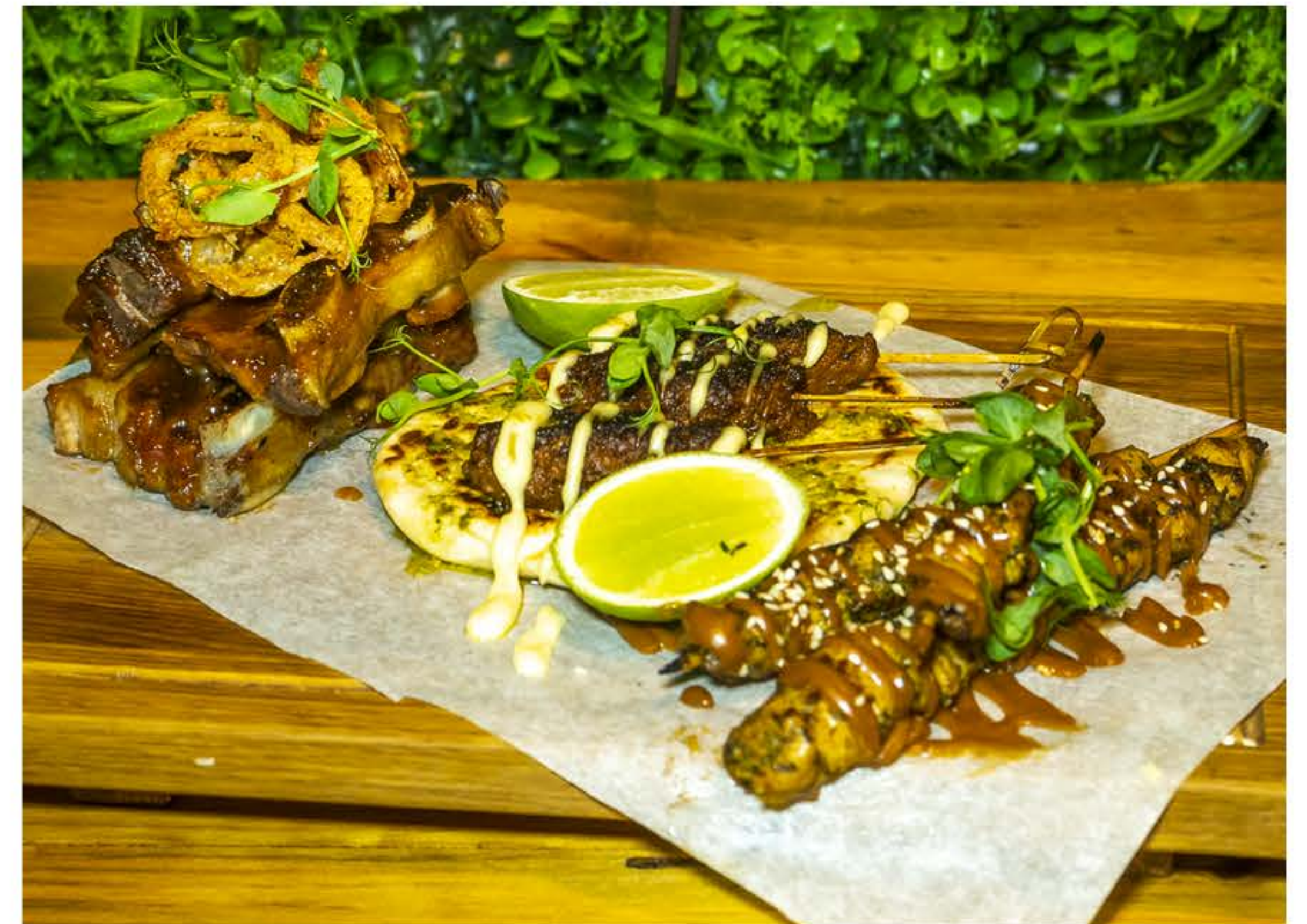
The Grazer R320

G&L prawns satays, black widow squid, west coast mussels with chips