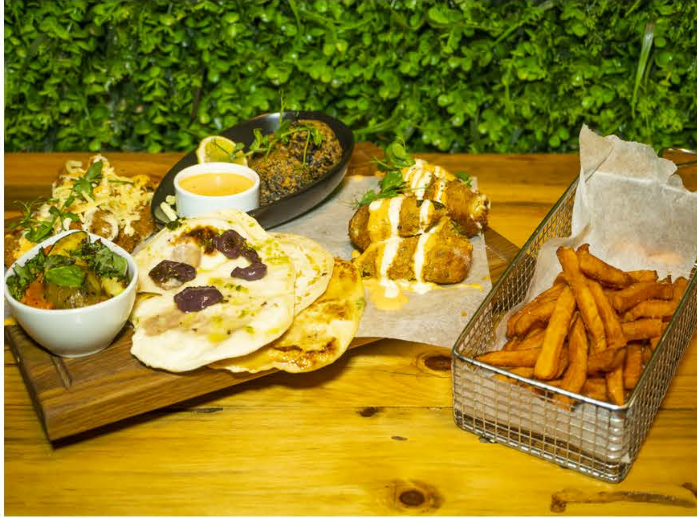
Garden of Eden R300

Fritto misto, aracini balls, bread board with sweet potato fries