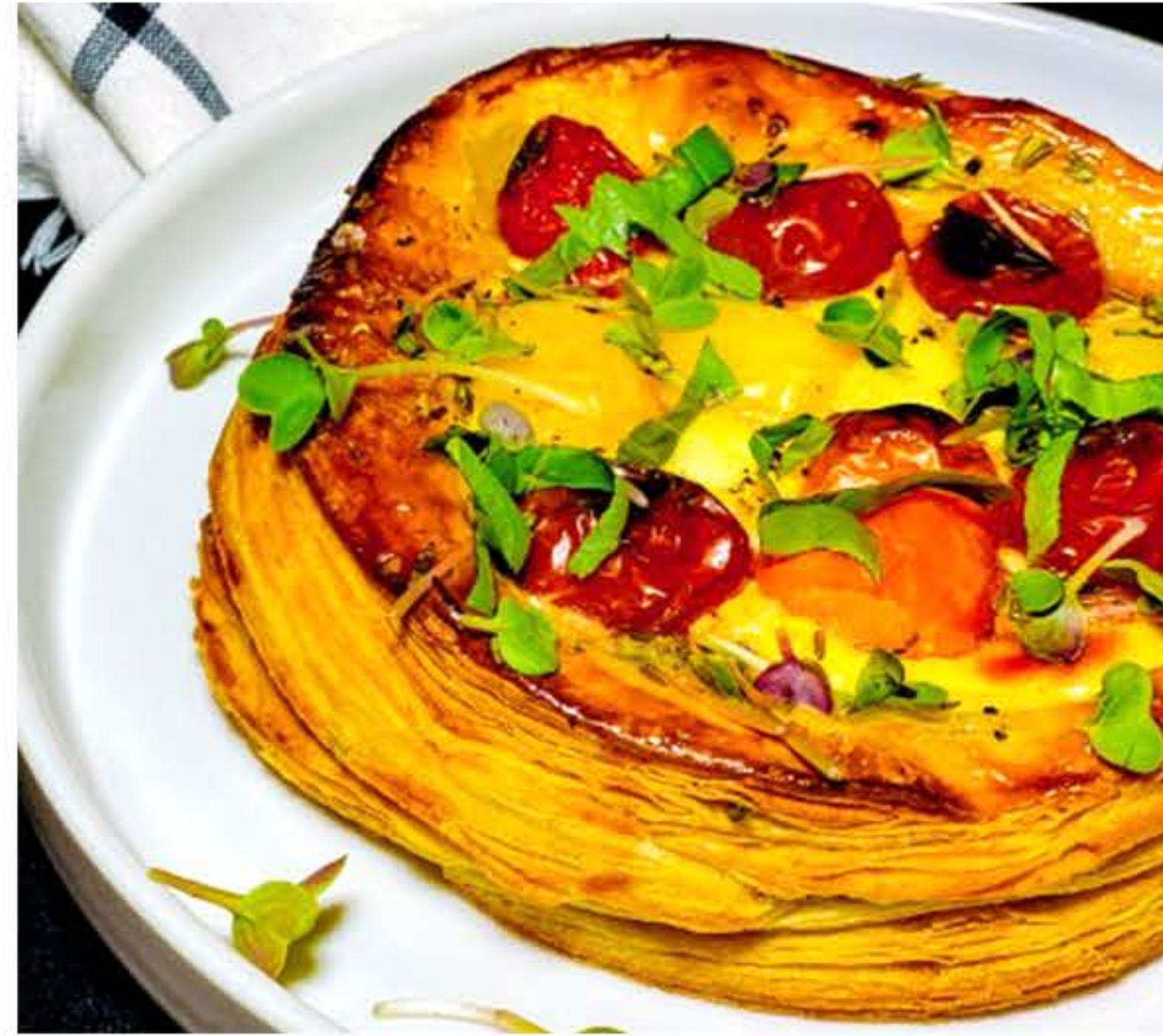
Puff-puff R95 Vine-picked tomato & mozzarella tart with a CBD honey & thyme vinaigrette