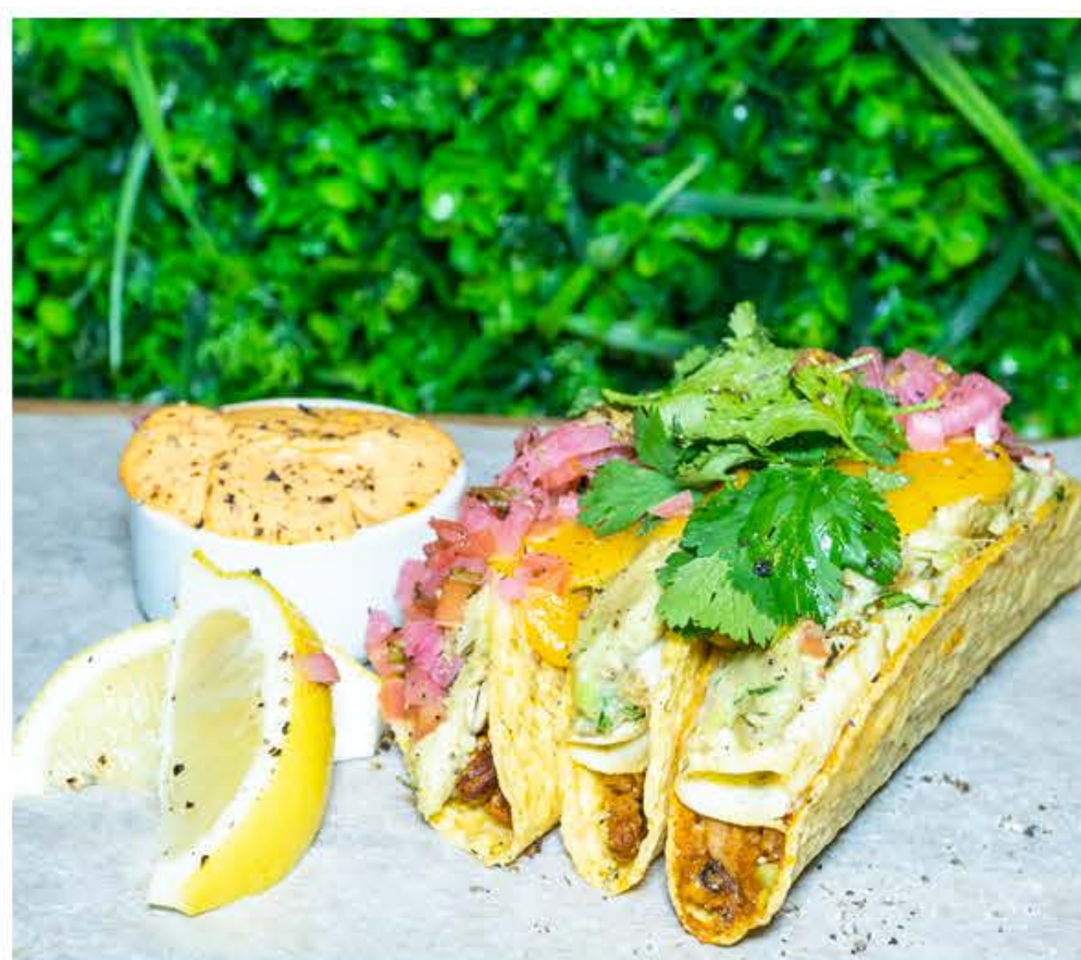
Training Day Taco R85

Mince, Ragout sauce, Red kidney beans, Toasted corn Cheddar cheese, Guacamole, Salsa. Coriander