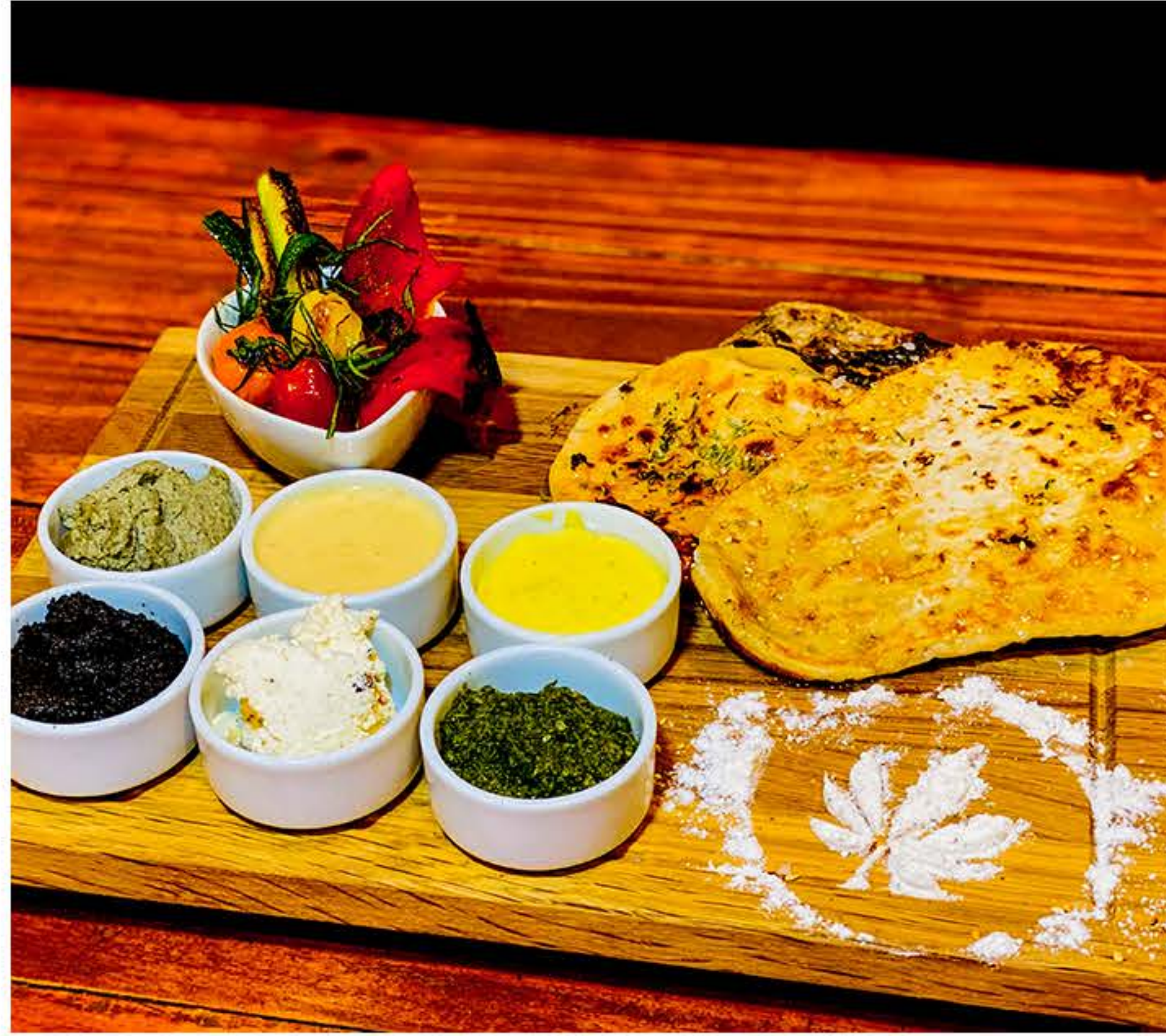
Mixed CBD Bubble Breadboard R98 honey & thyme, fennel & olive, coriander & sesame seed bubble bread with grilled veg, hummus, baba ganoush, olive tapenade & 3 dips: salsa verde, roast ricotta & rosemary and roasted garlic mayo