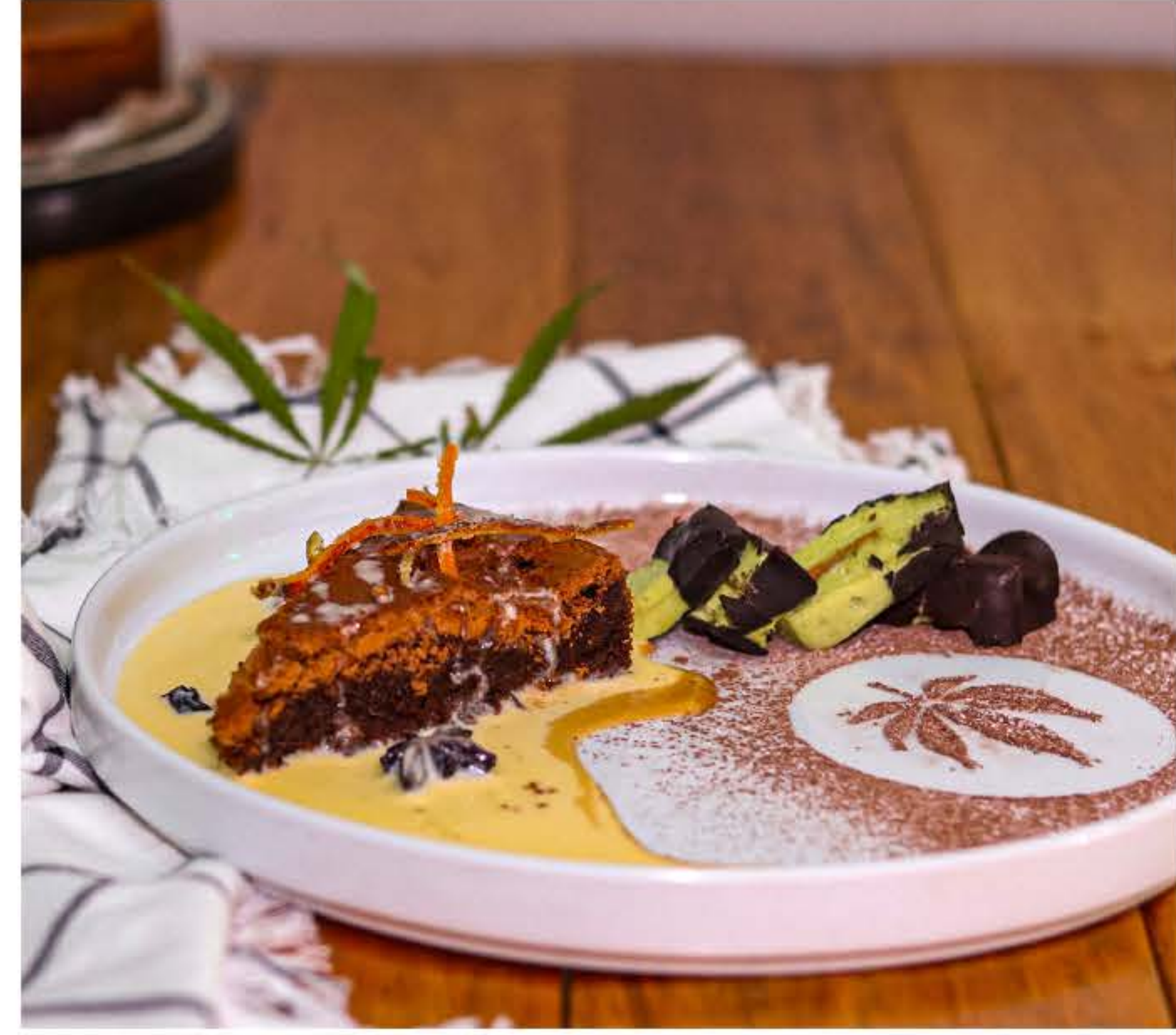
Flourless Chocolate Space cake R65 "yes no flour" with orange peel candy & star anise sauce a l'anglaise