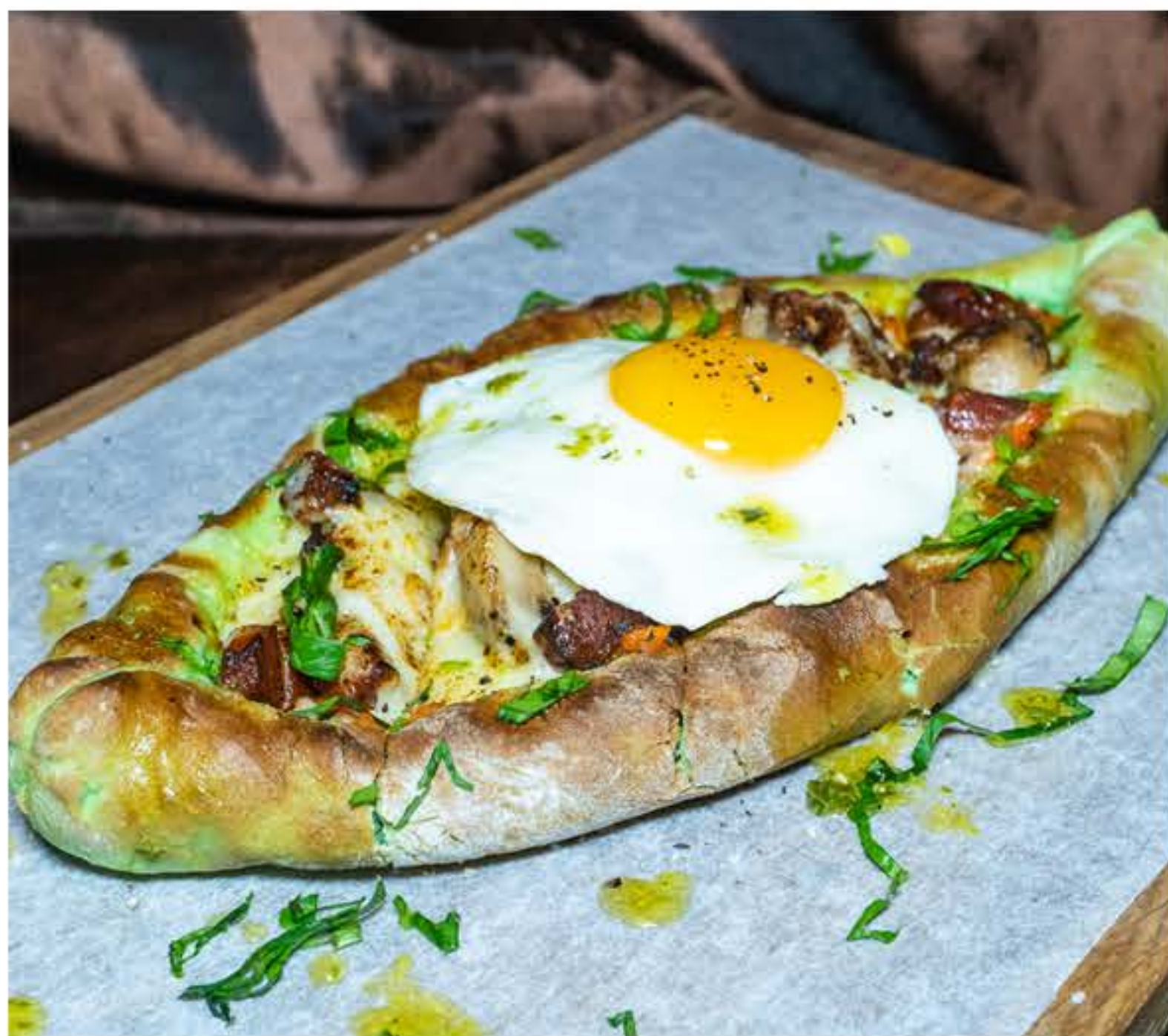
Rock Star R95

Honey-glazed pancetta, Portobello mushrooms Candied red onions, Sweet tomato sauce Mozzarella, Fried egg