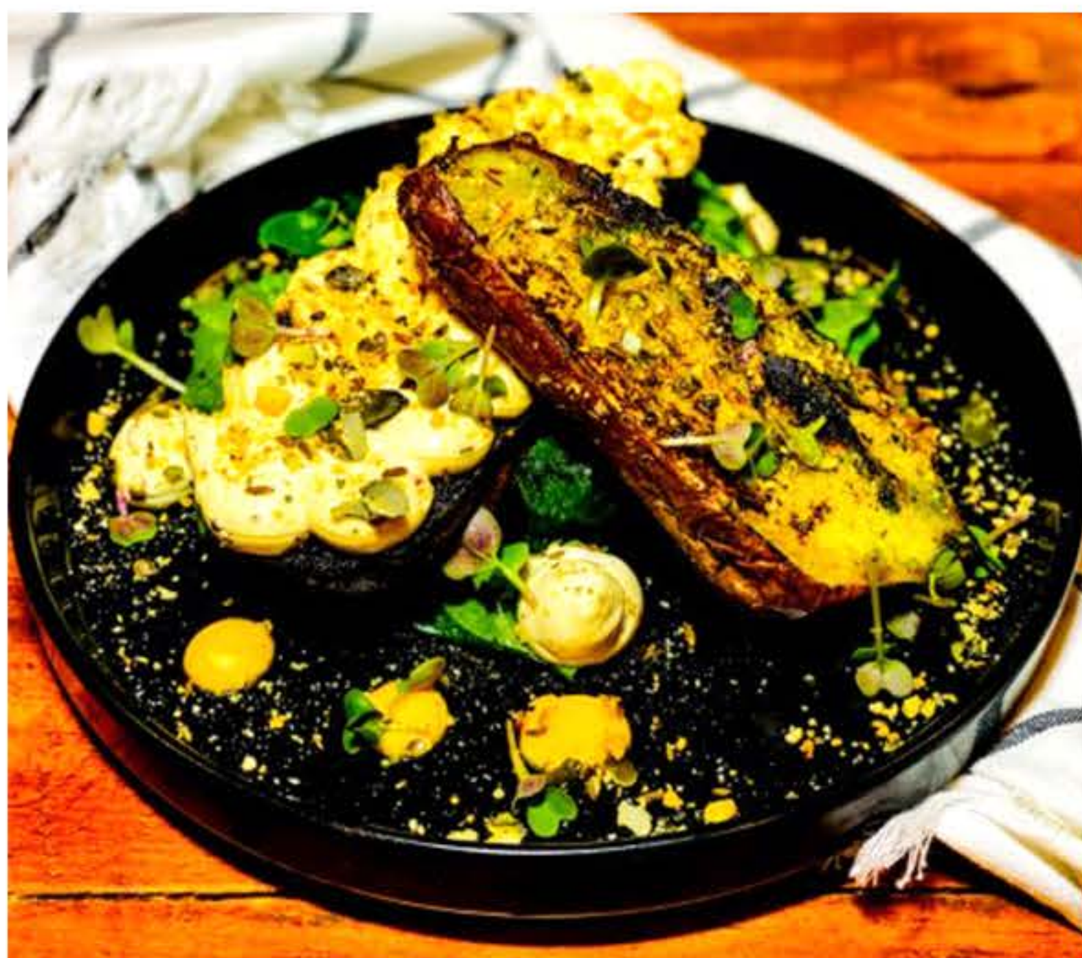
Charred R80 half-baked roasted sweet potato with CBD goat cheese & candy cashews