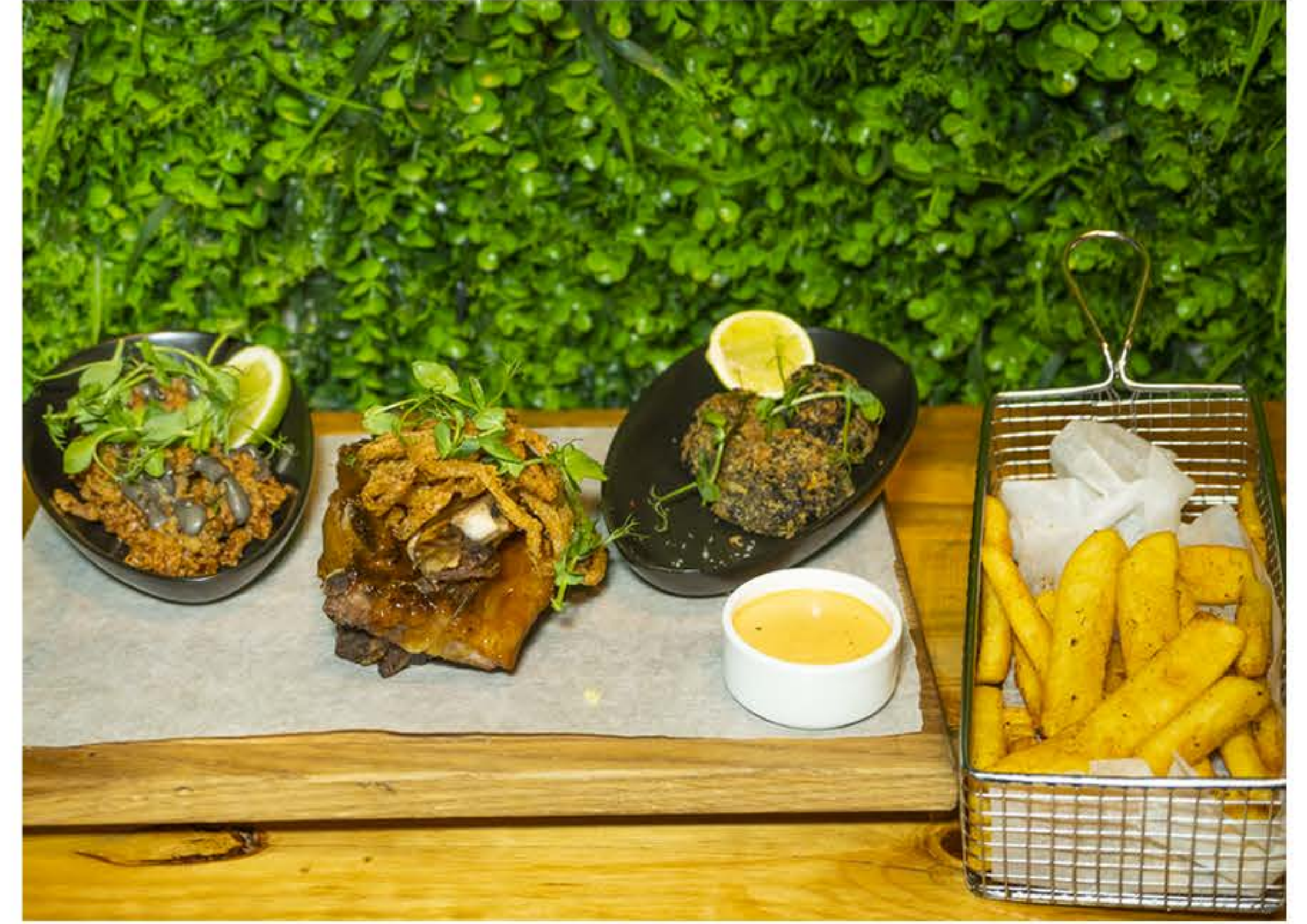
High grade R300

Fritto misto, aracini balls, bread board with sweet potato fries