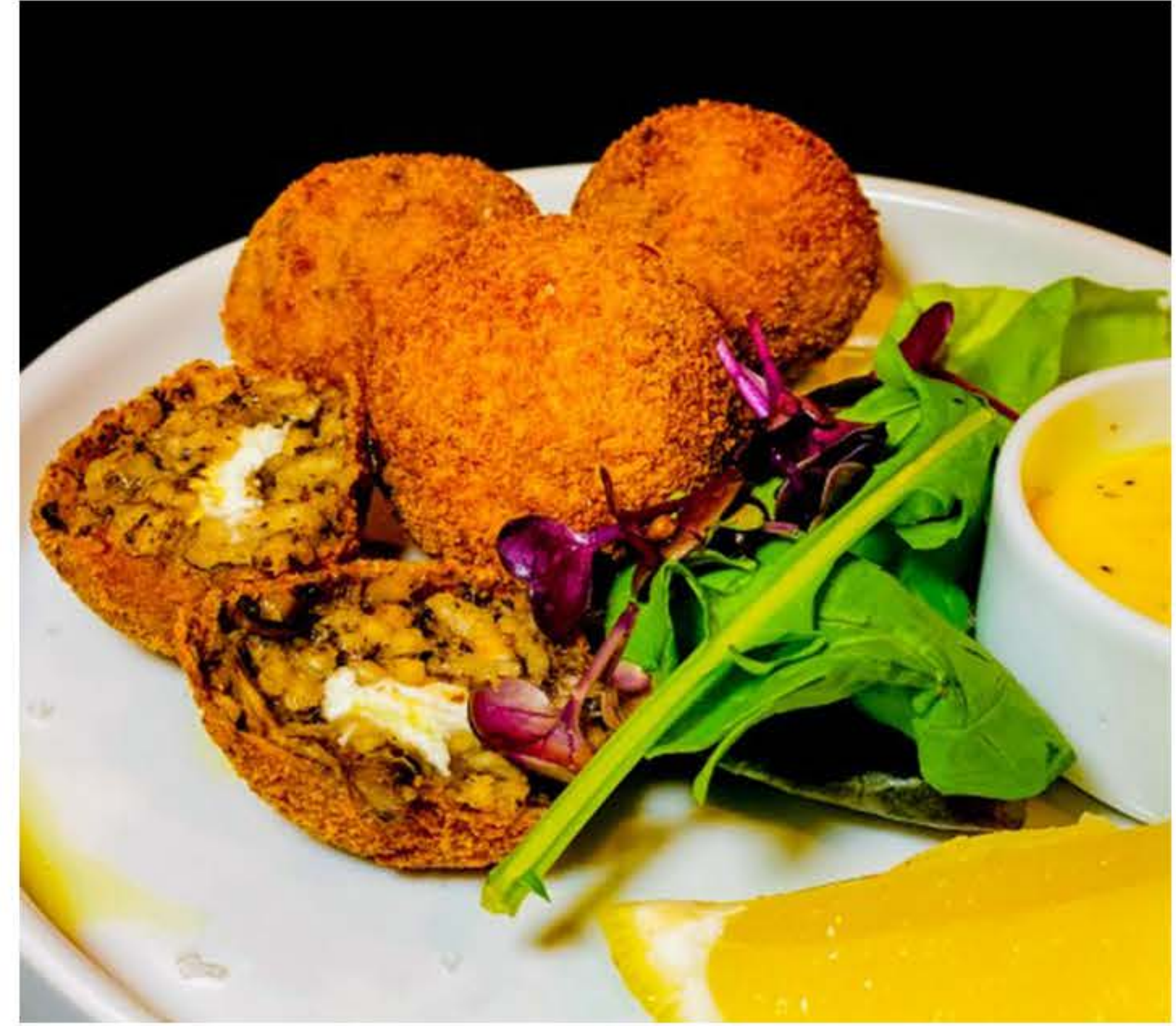
Shroom arancini balls R90 stuffed with house ricotta & lemon mayo