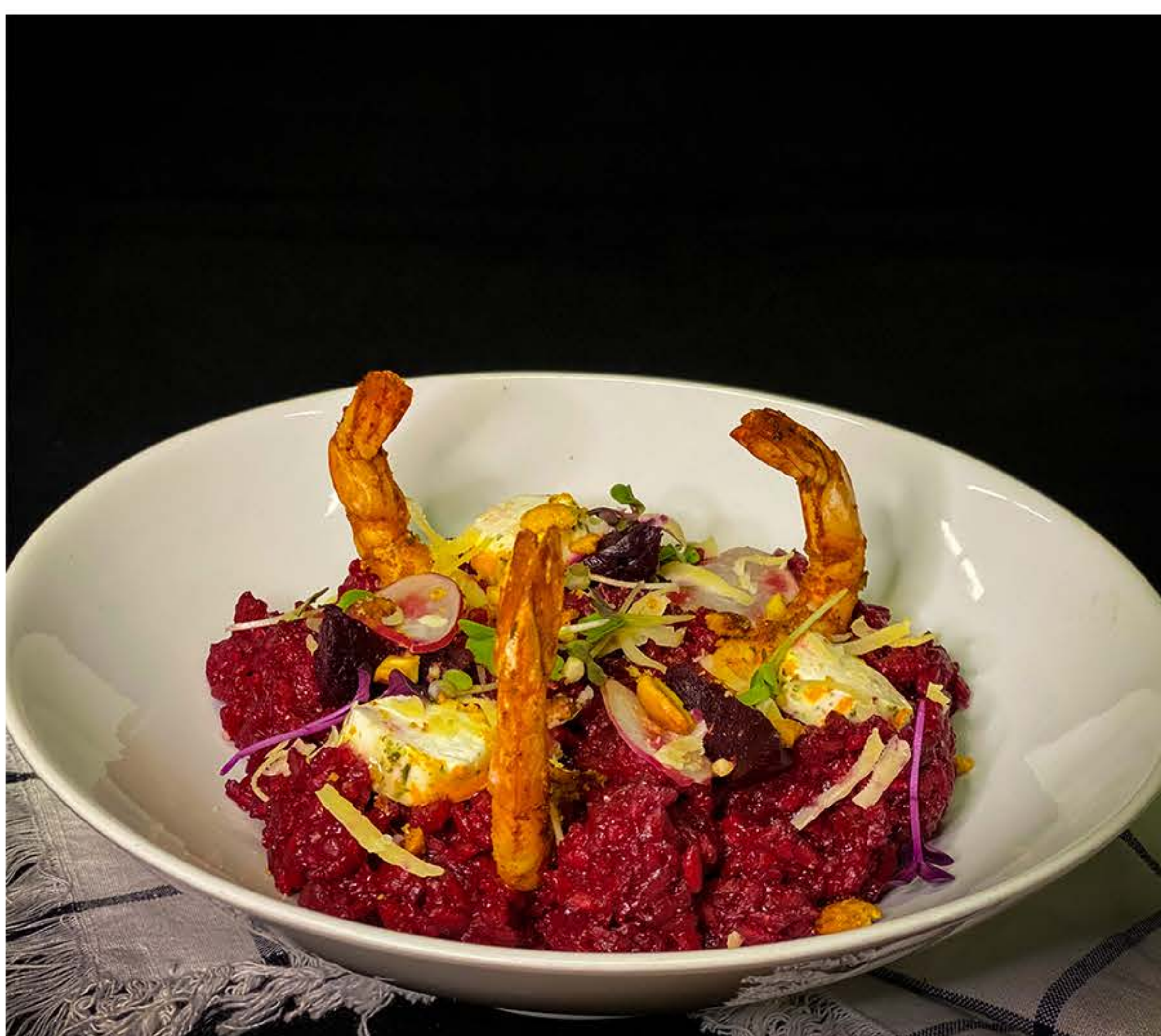
CBD Purple Haze R130 super beetroot risotto with candy beetroot, orange crust goats cheese & grilled prawns