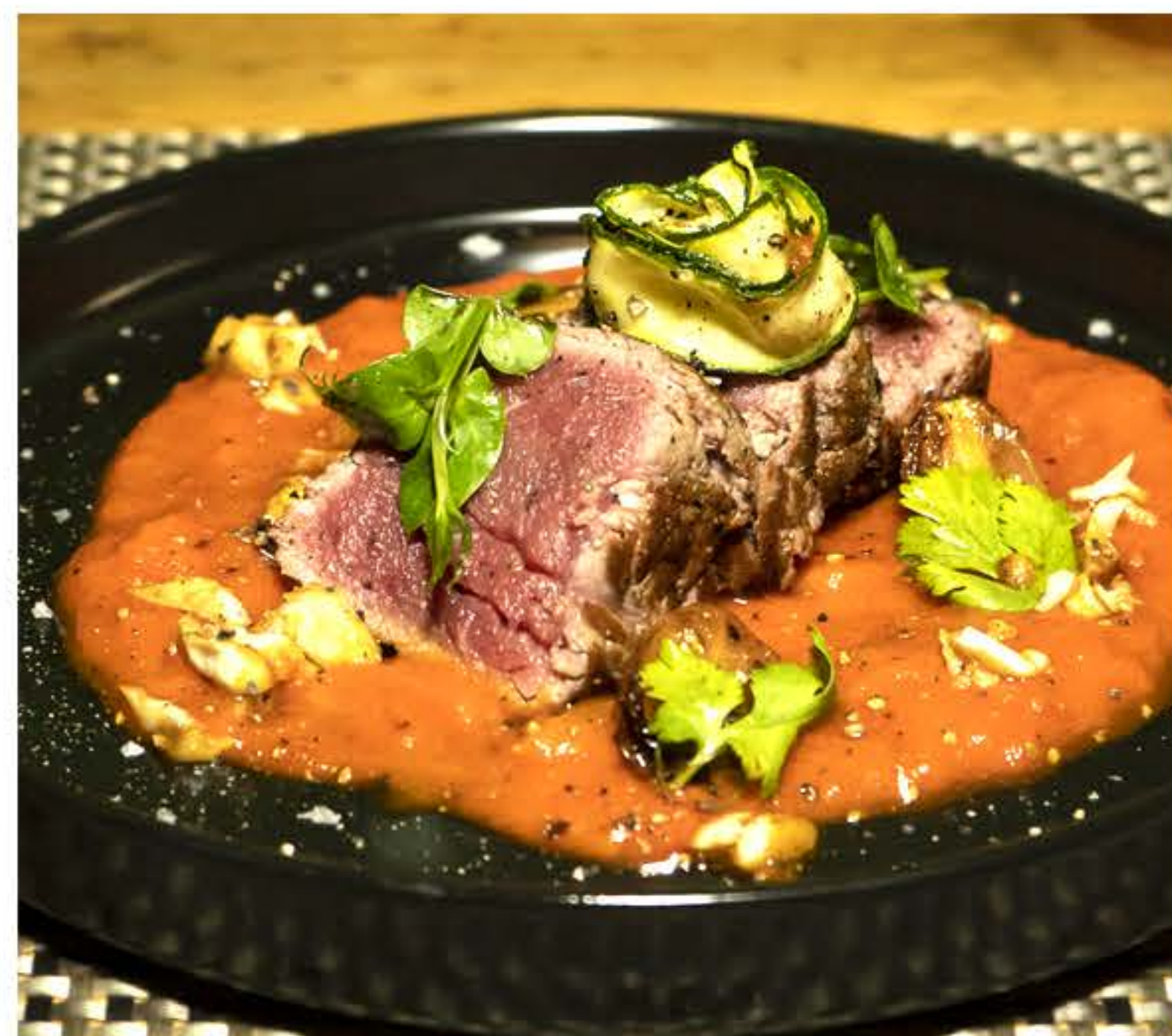
Fillet-mesco R110 Tender fillet madallions plated on top of a CBD mesco sauce