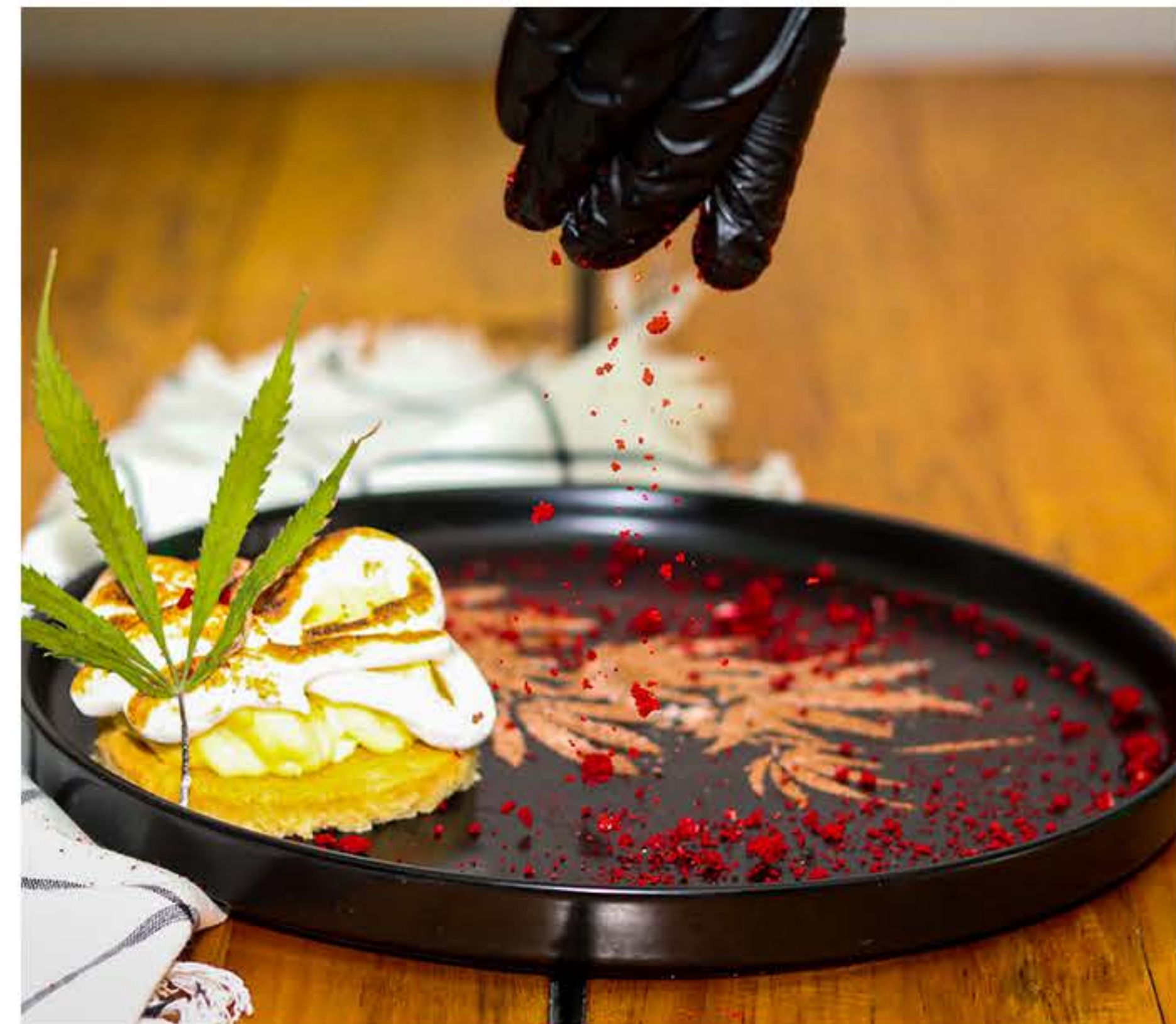
O.G. Kush Lemon & rooibos R65 curd on short bread with brulee Italian meringue