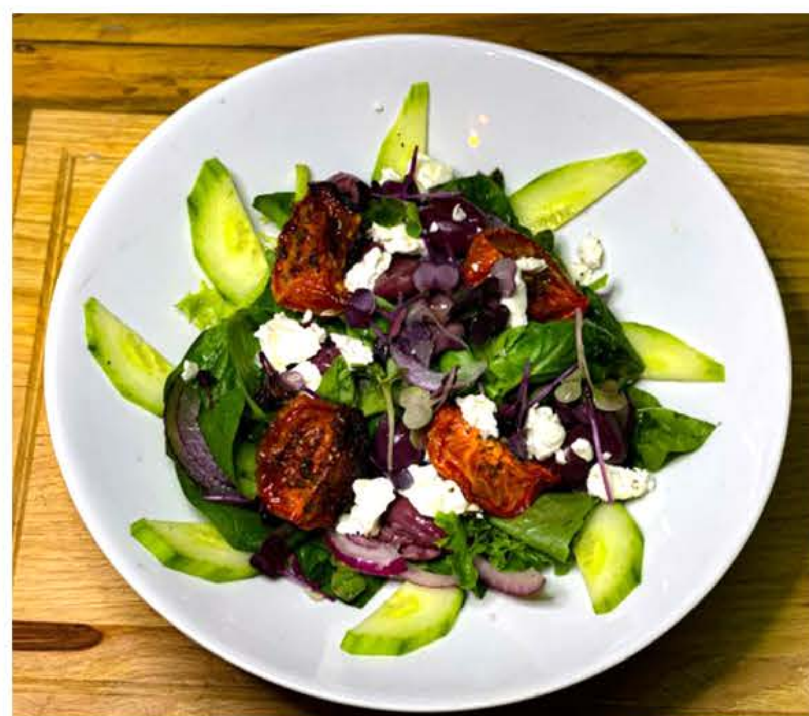
Greek salad R55 with CBD oven dried plum tomato, olives, cucumber, red onion, basil & creamy feta cheese served with a CBD herb dressing