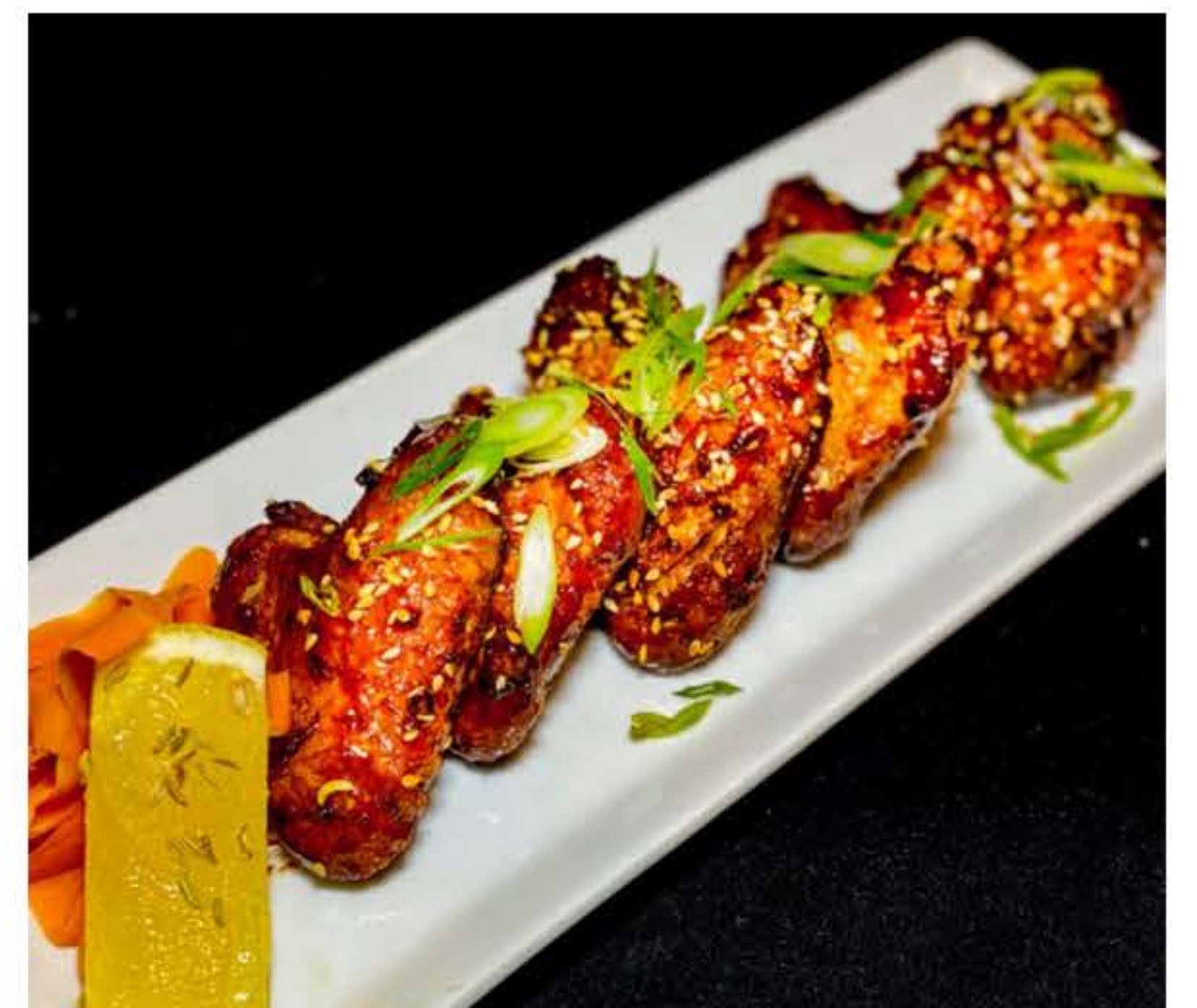
CBD Dark Star R95 Tabasaki Crispy Japanese-style wet chicken wings with in-house pickled carrots