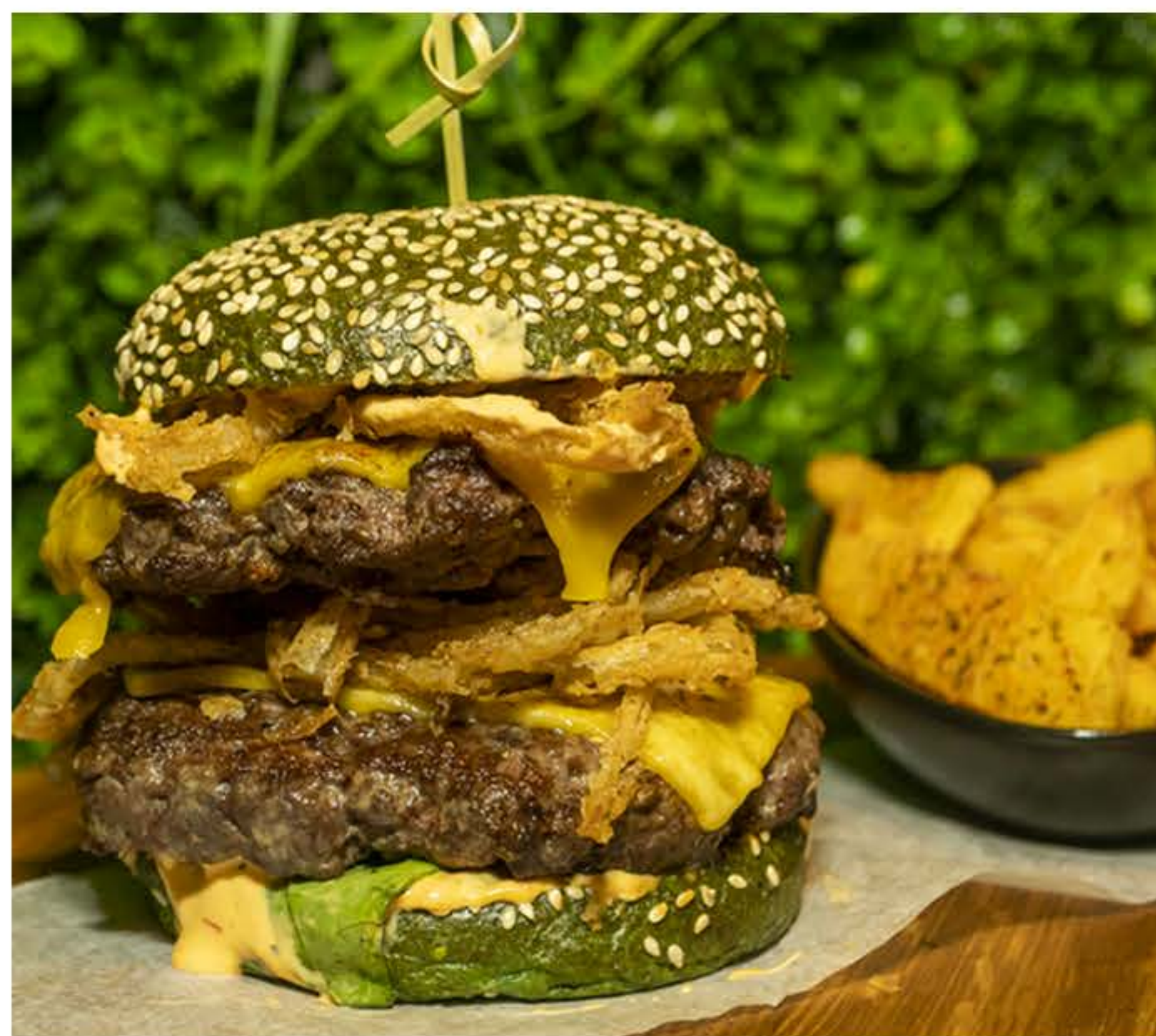
Mega high CBD original double cheese R185 2x180g burger with hand cut chips & onion rings