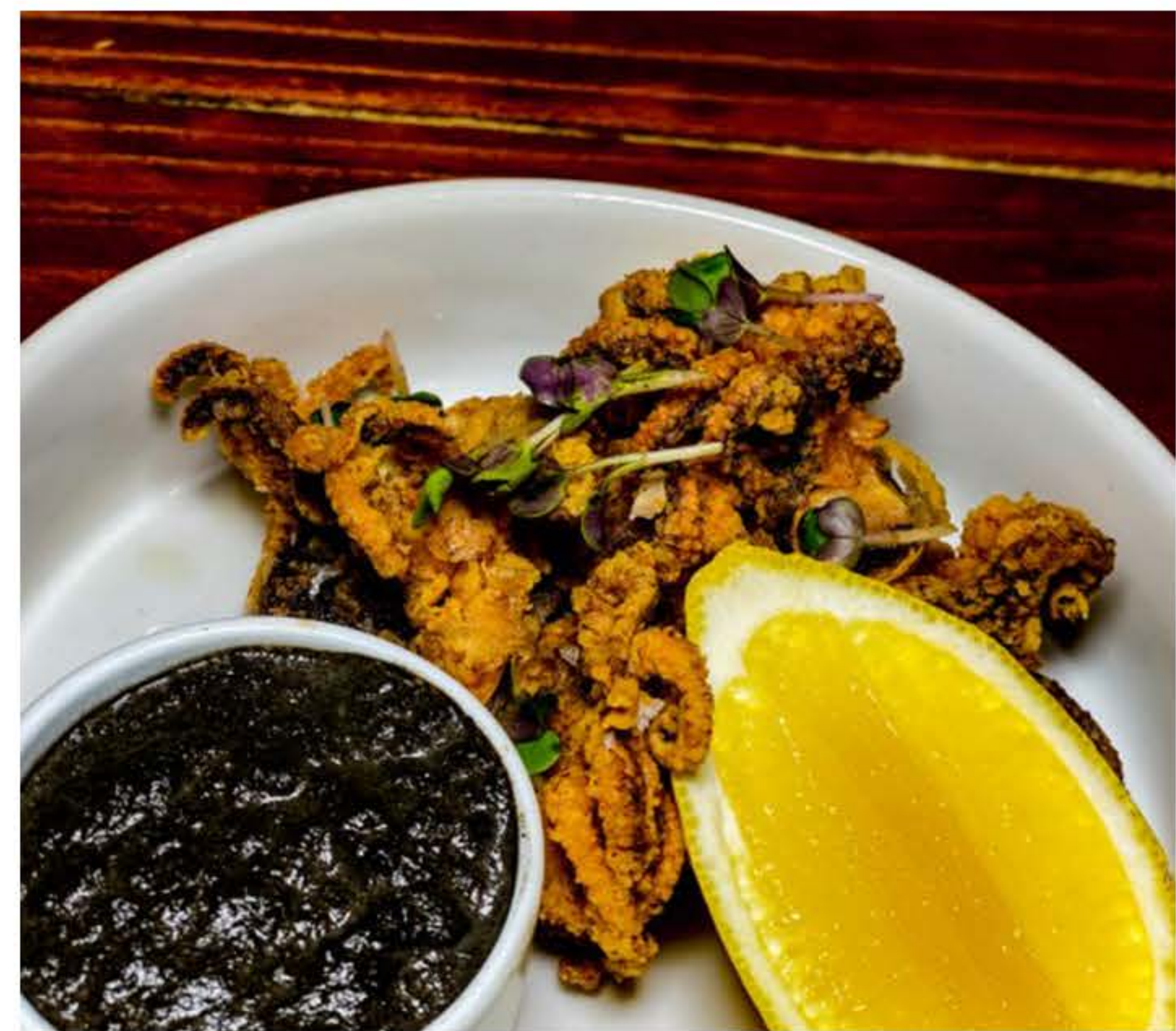
Black Widow Squid R85 hemp seed flour with CBD black squid ink mayo