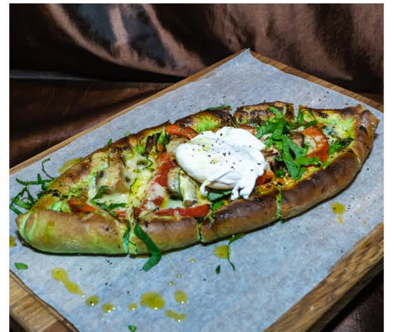
Earth OG R95

Spicy, grilled chicken breast, Roasted red pepper Candied red onions, Sweet tomato sauce Mozzarella, Fried egg