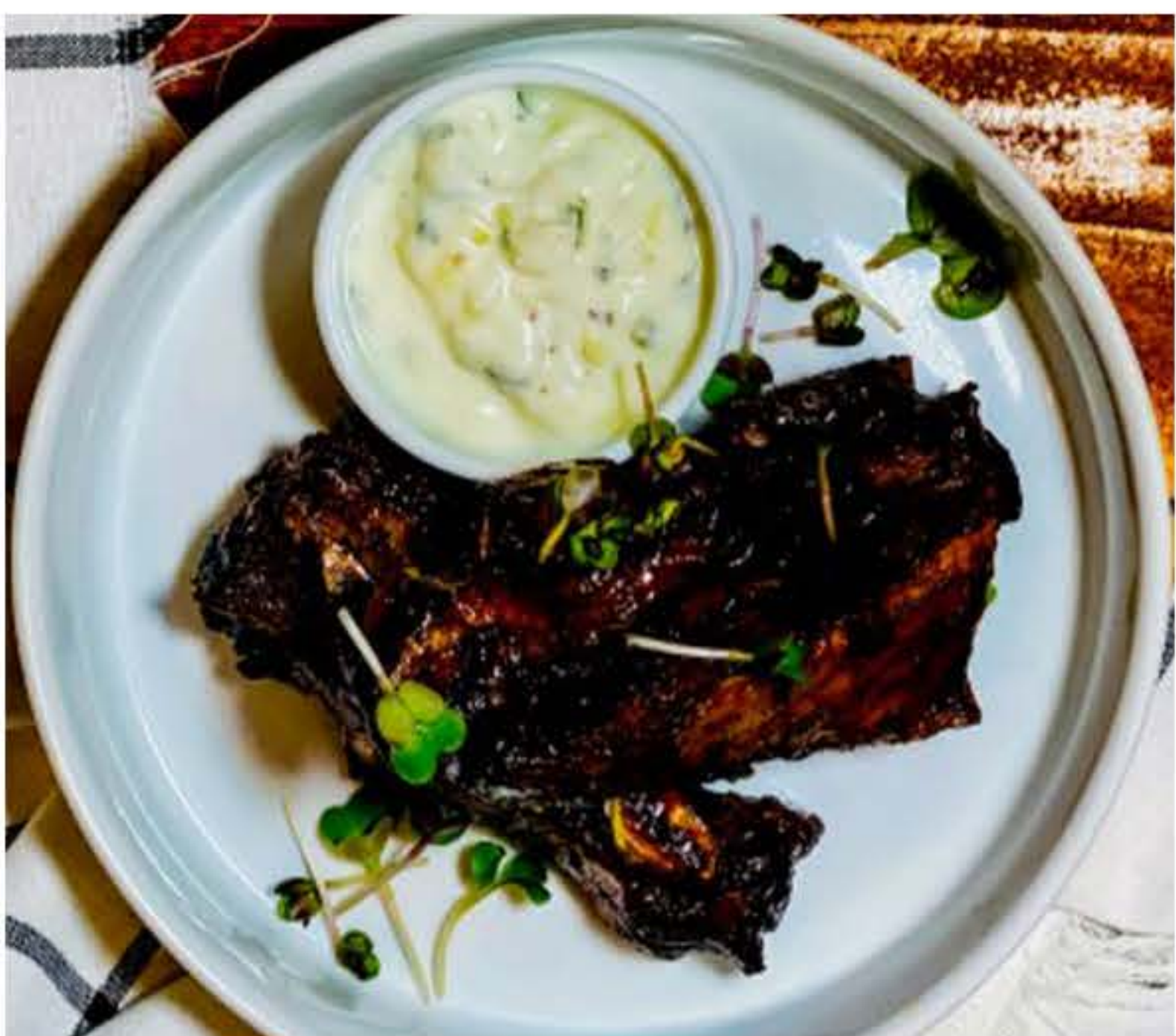
Two finger R95 smoked ribs in a dark smoky CBD bbq sauce