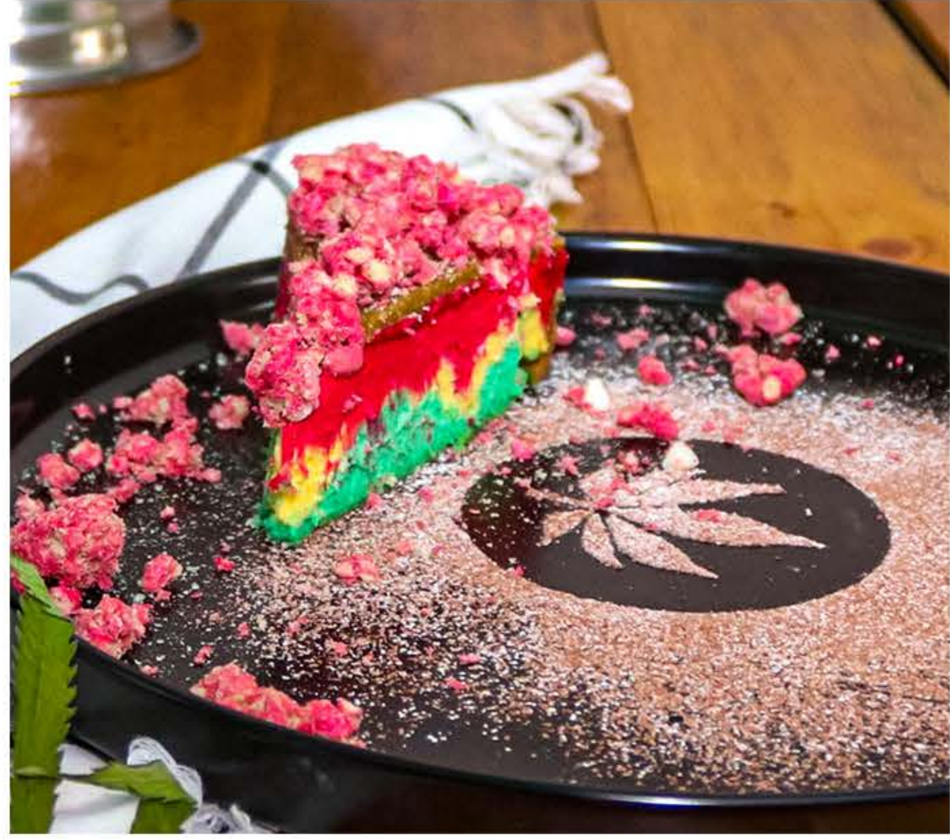
Baked Exodus R75 cheesecake with hemp cookie crust