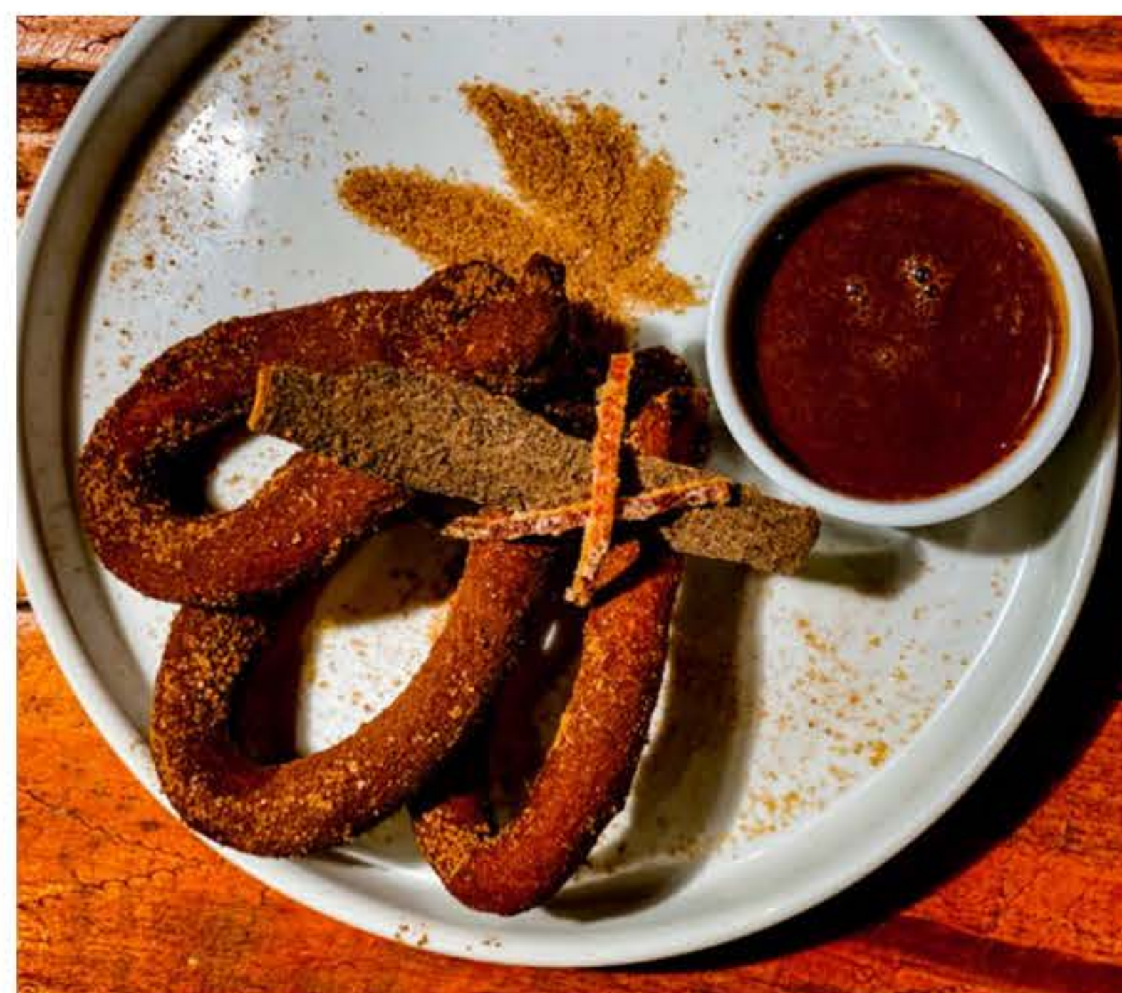
Churounds R50 with a CBD cinnamon & chocolate sauce