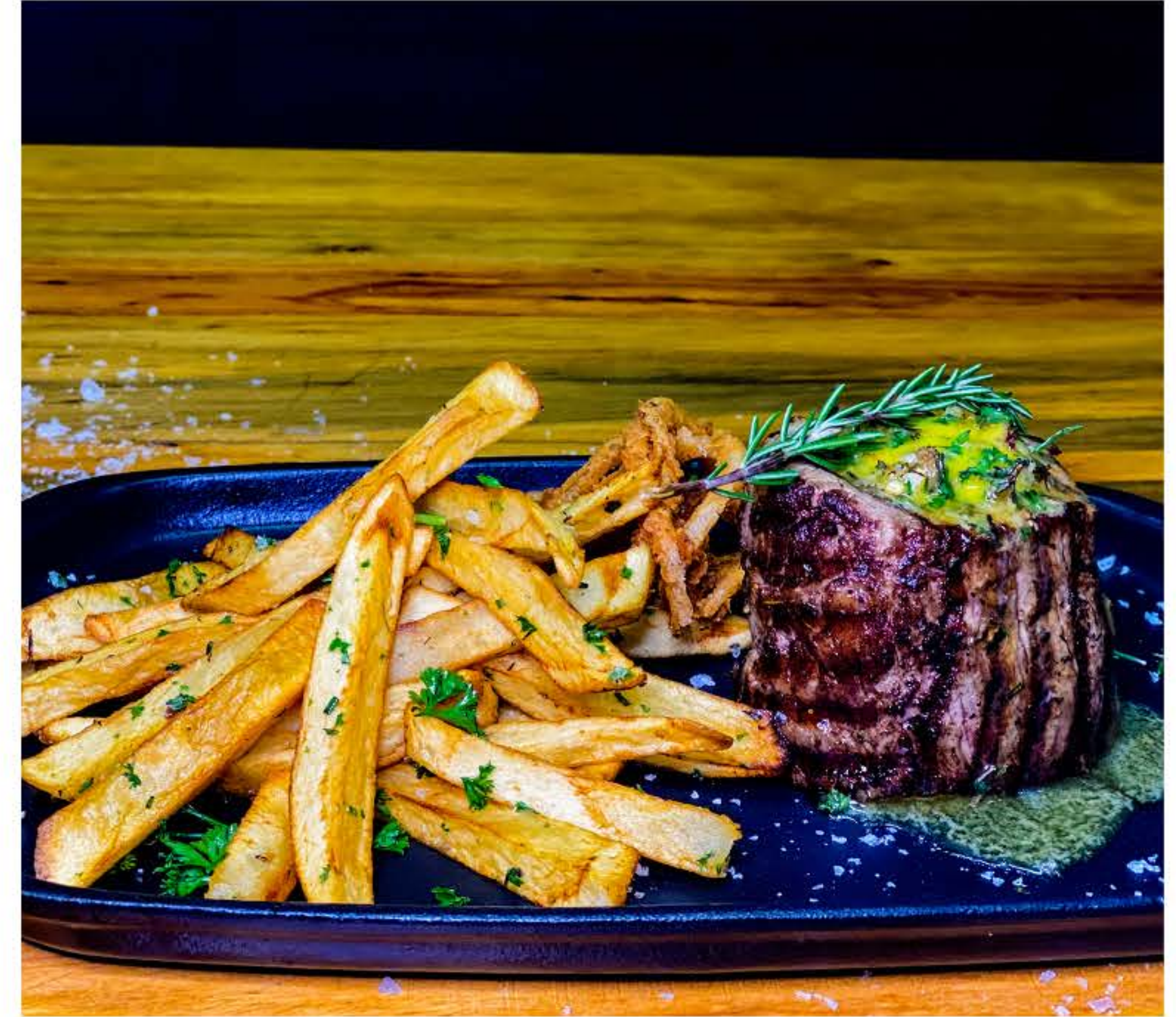
CBD Sleeping beast cut steaks with hand cut chips & onion rings

Fillet Sirloin -250g R160 -250g R110 -300g R190 -300g R120