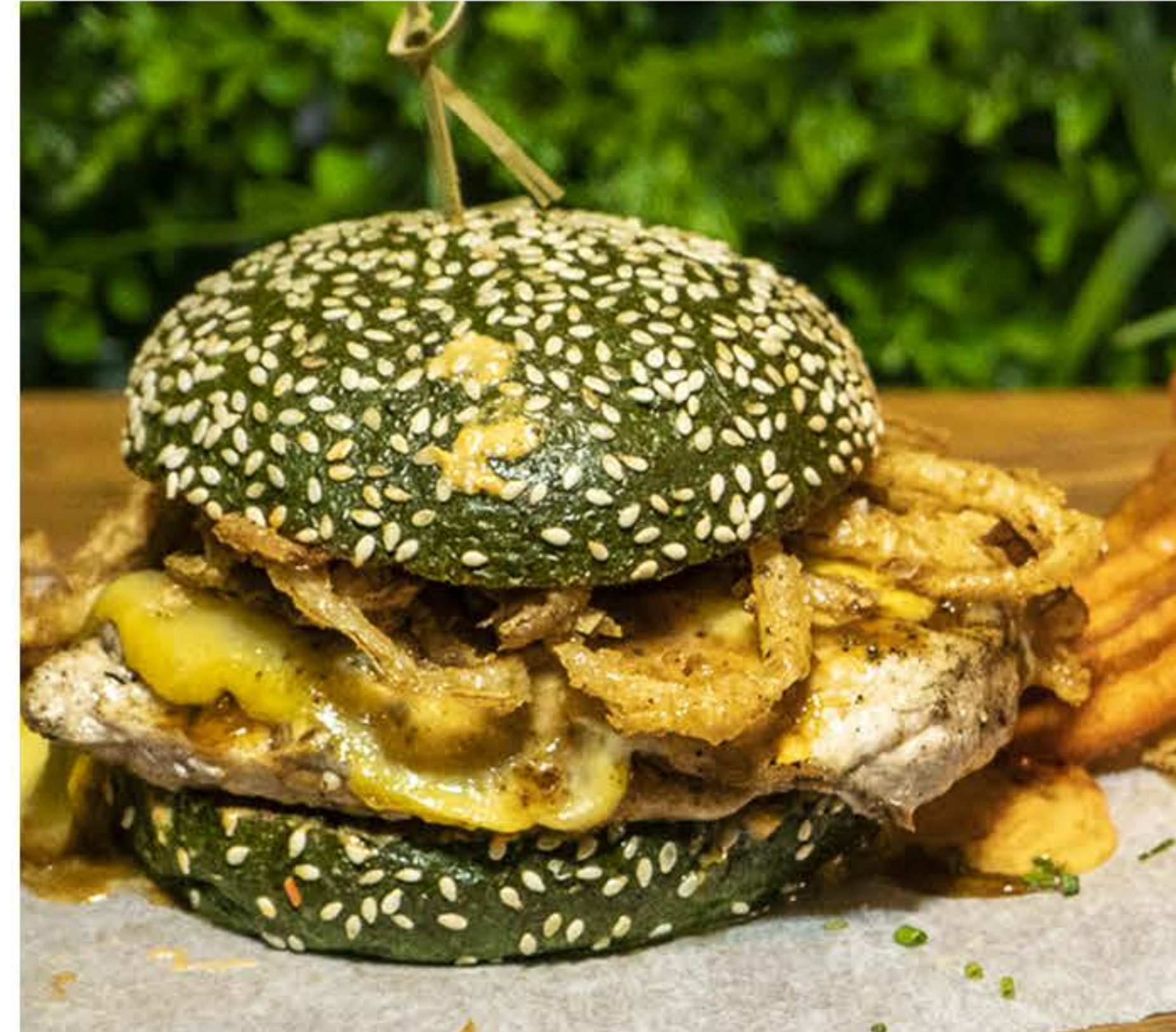
High Hen Burger R90 Juicy chicken fillet burger, topped with onion rings, cheese and CBD relish