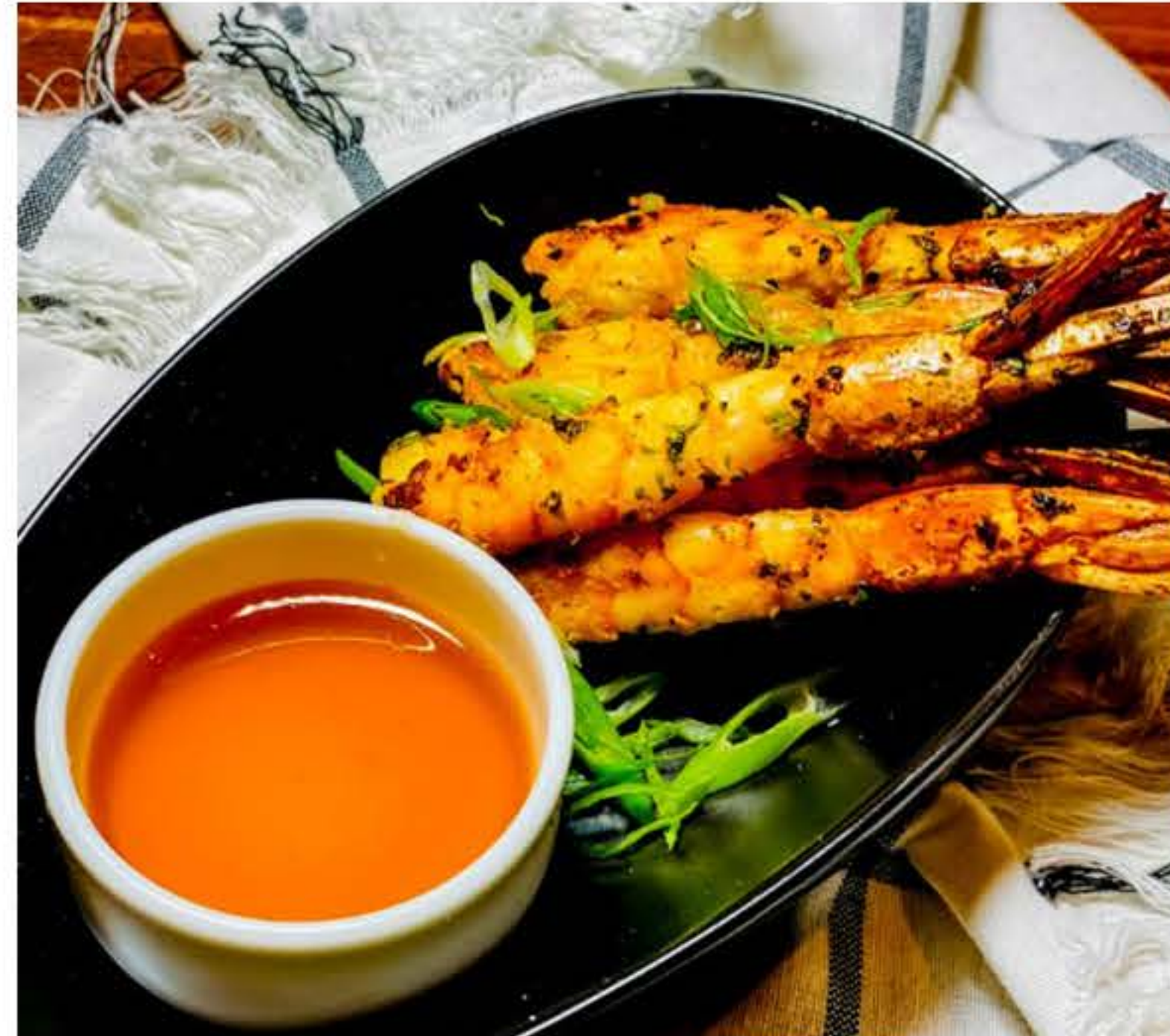
The G&L O.G.Prawn satay R95 with a CBD ginger & lemongrass reduction