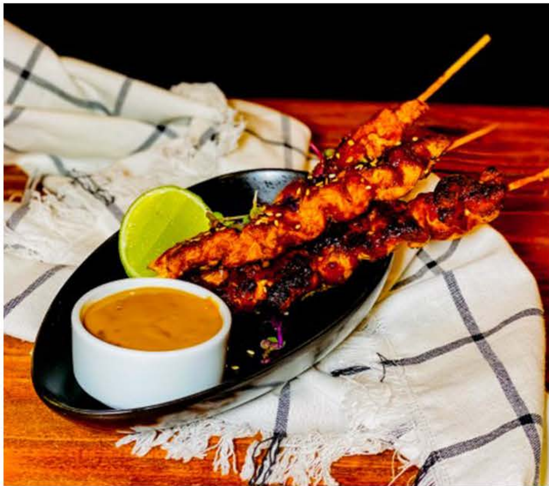
King's Cross Chicken R80 satay with a CBD peanut butter & maldon salt dip