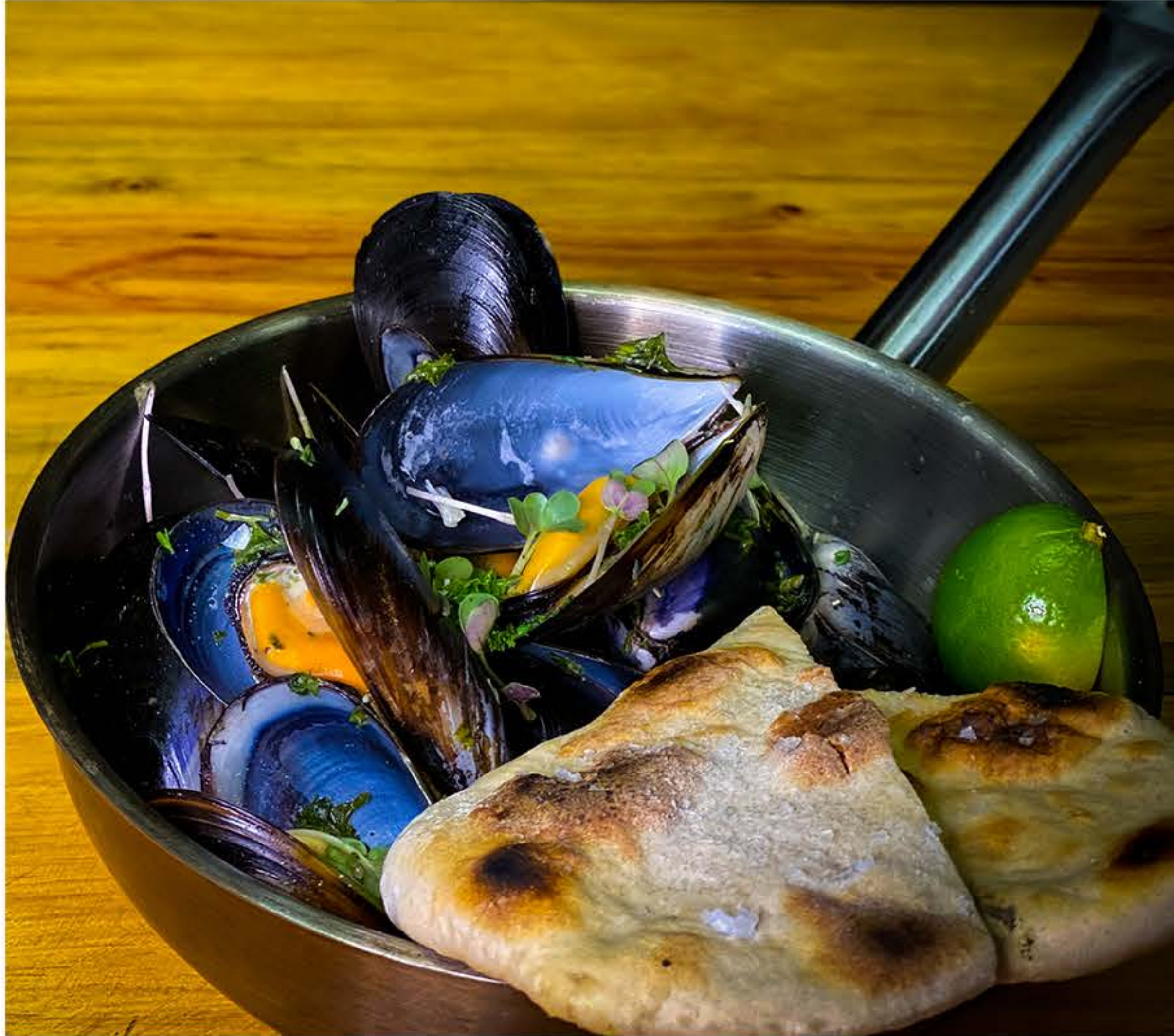
West coast baked mussels R120 in a white wine, cream, roasted garlic & parsley with CBD salted bubble bread