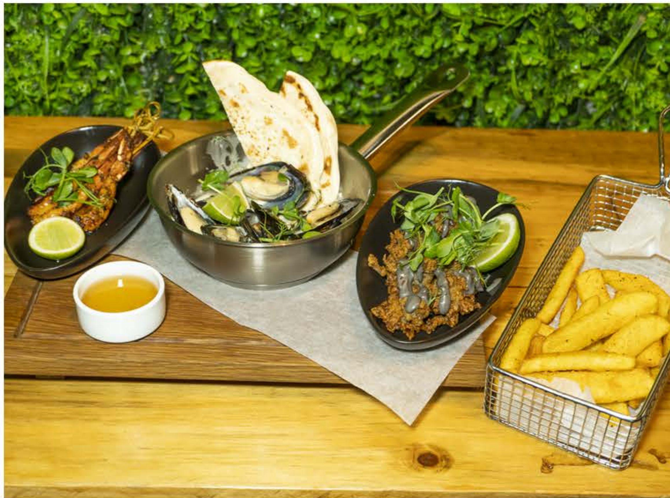
The Slow boat R320

2 finger ribs, aracini balls, black widow squid with chips