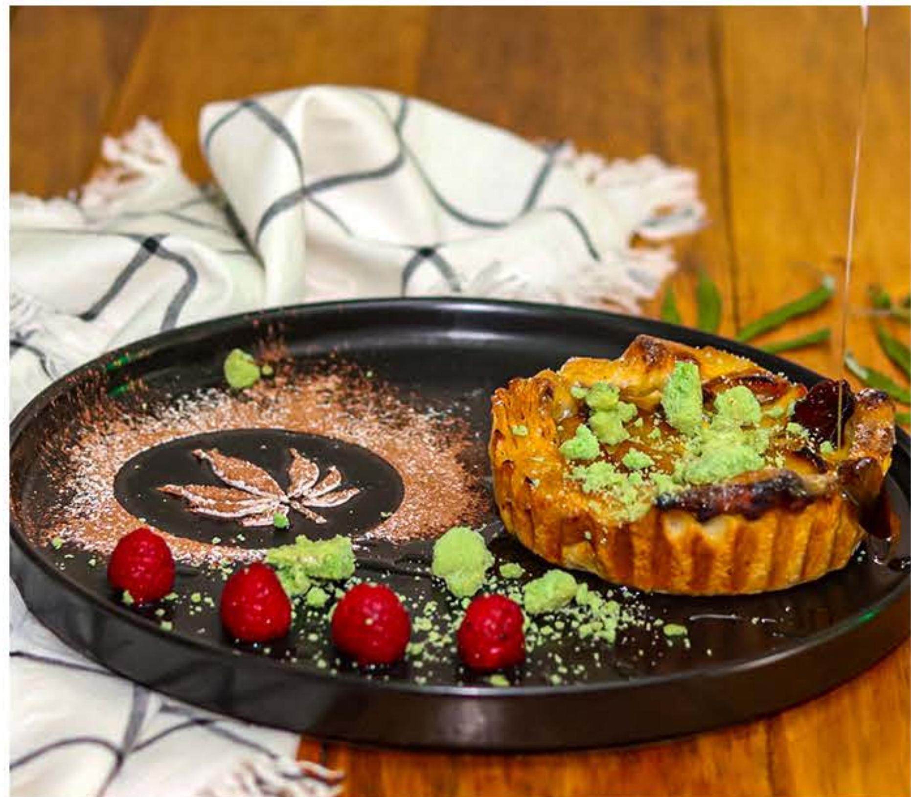
Hotbox apple & custard puff pastry tart R65 cinnamon & ginger syrup, with fresh pepper berries