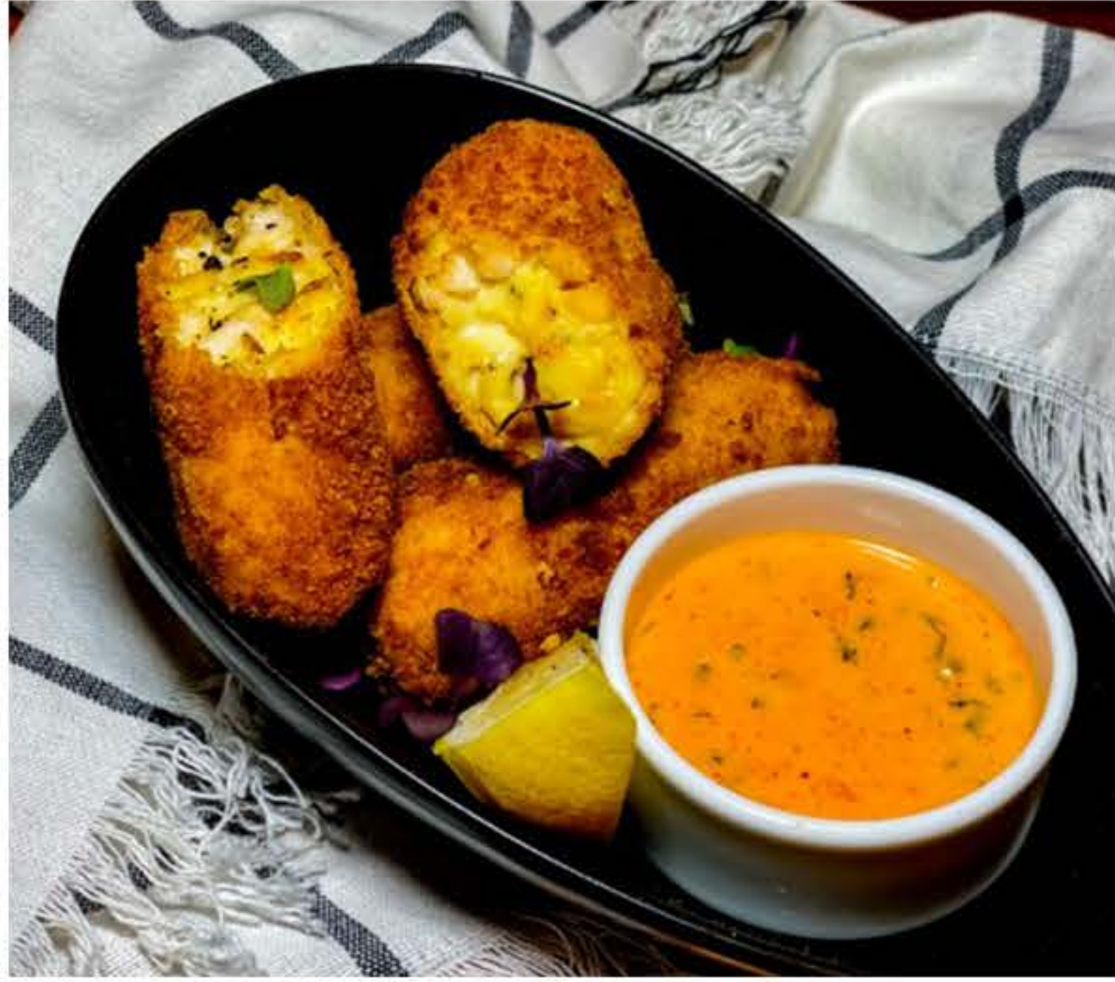
Pancetta & cheese OR chicken & corn R70 cana-quettes with CBD spicy mayo