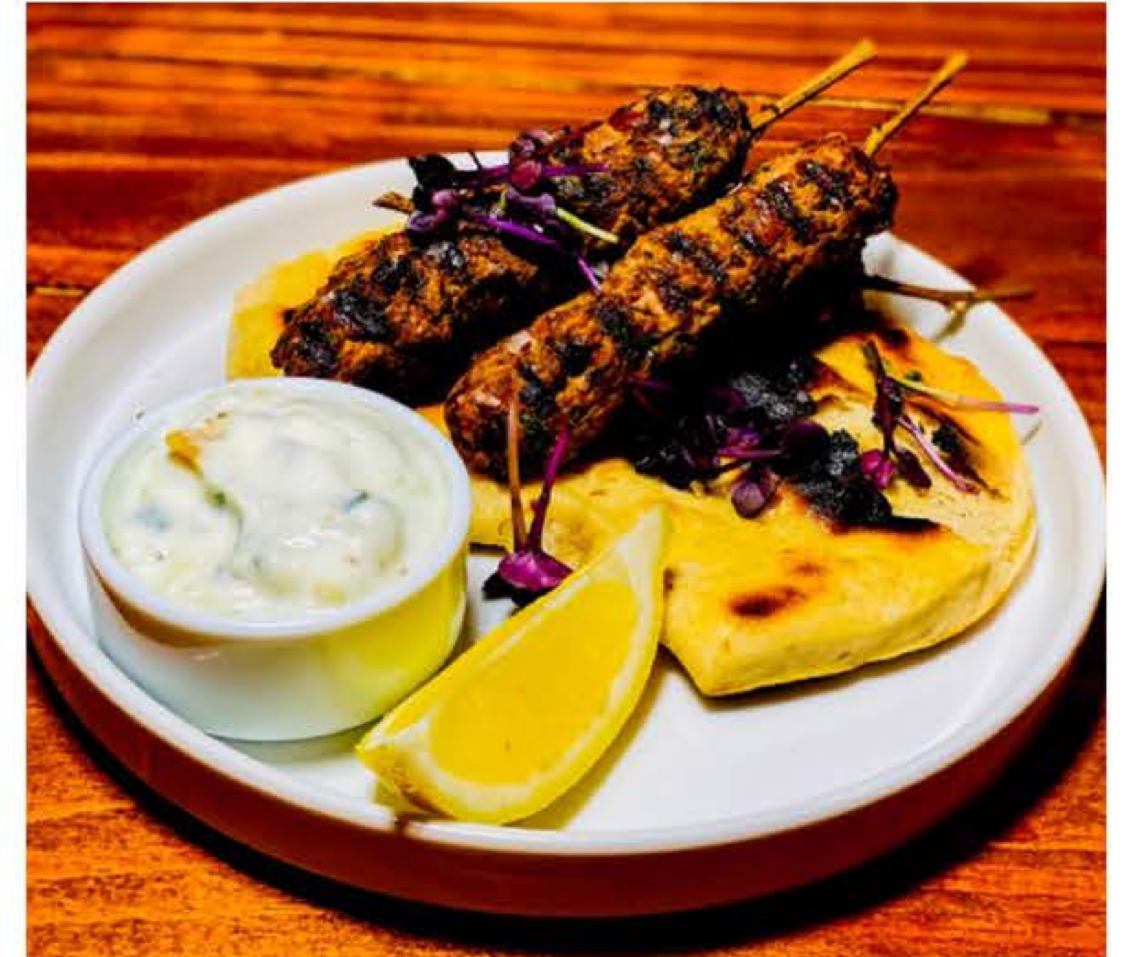
Lamb kifka on a cannabis stick R100 with CBD cumin & coriander tzatziki and CBD salted bubble bread