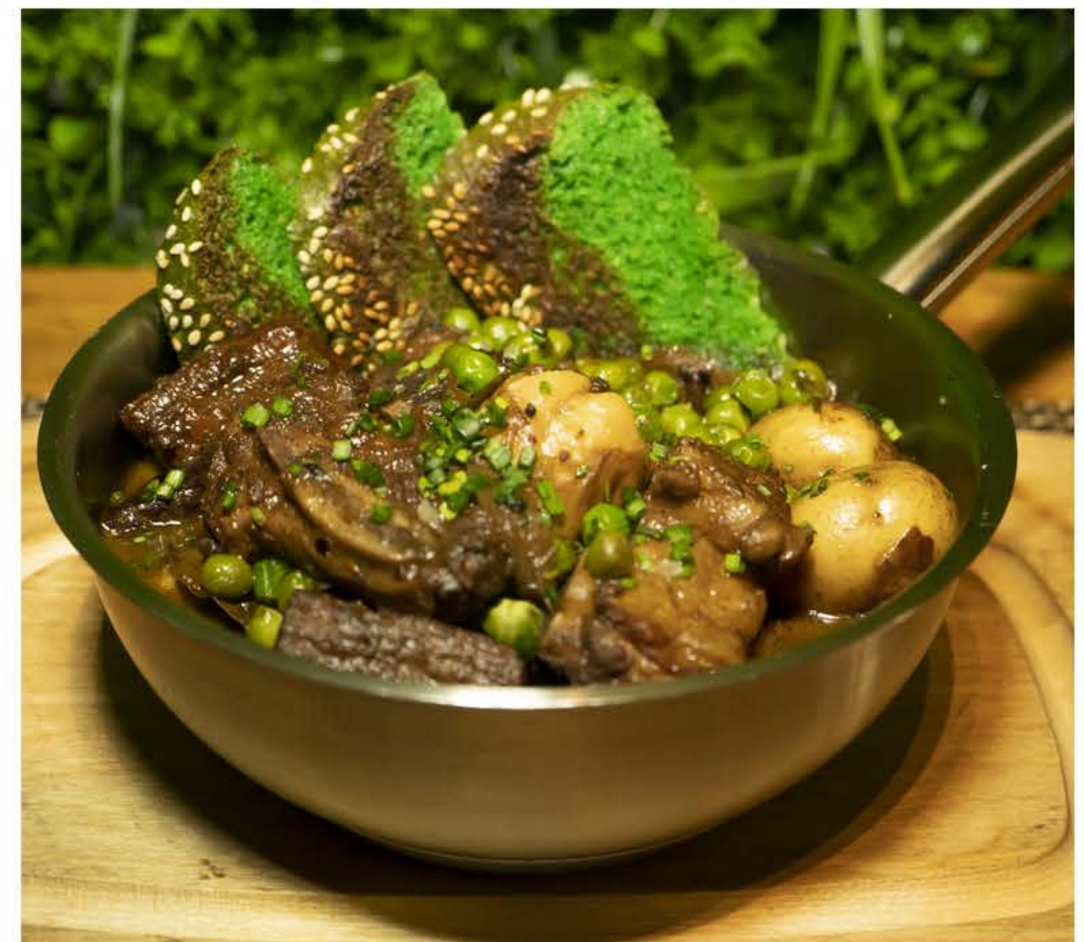
Slow grazer R120 Highly slow simmered lamb stew, hearty and tenderly infused with CBD