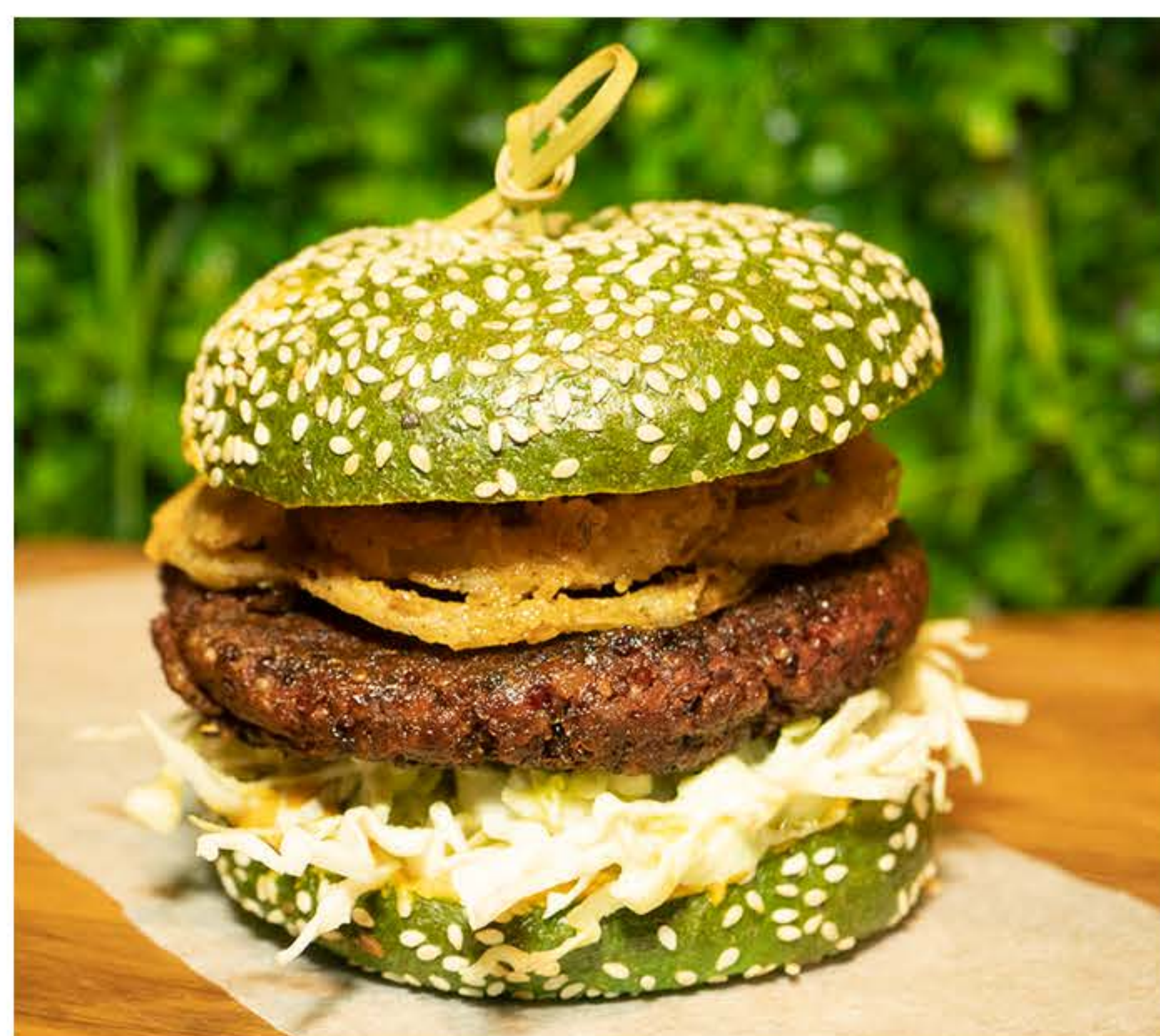
Purple Veggie Burger R110 plant-based burger, wasabi coleslaw, carrot hummus with sweet potato chips & onion rings