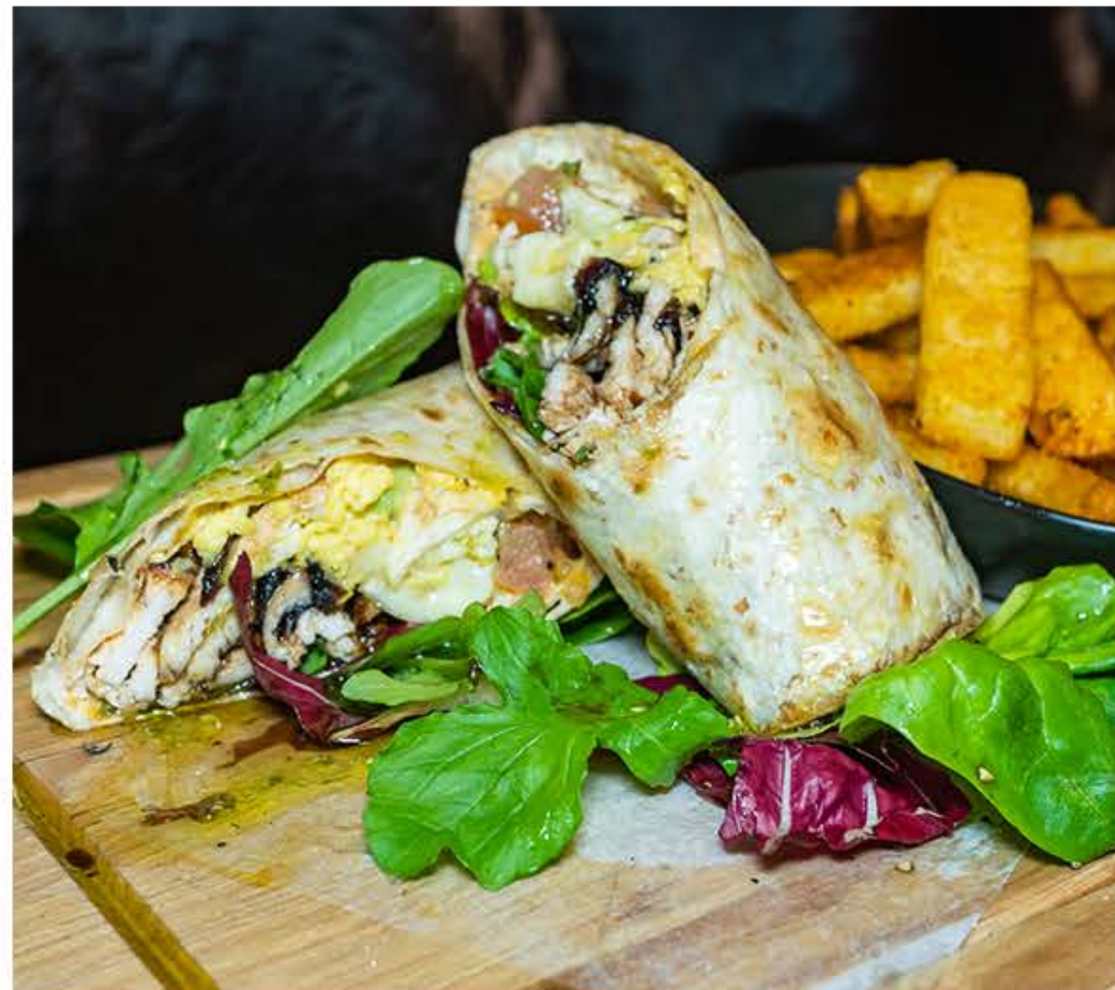
OG Roller R85

Chicken breast, Sriracha mayo, Baby leaves mix Mozzarella Tortilla wrap Served with rustic fries