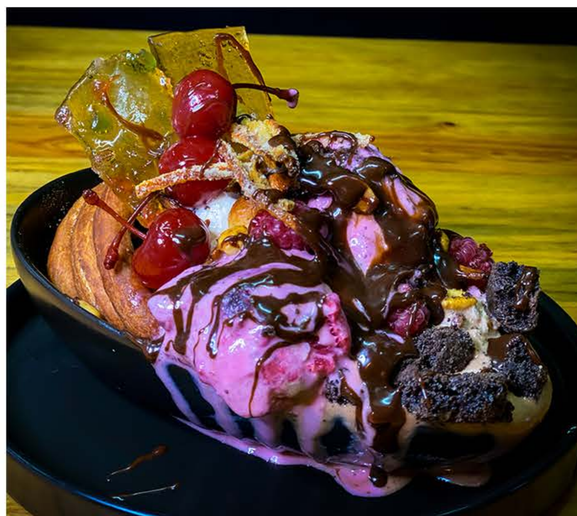
"Half pound" Ice cream sundae R120 a vanilla bean, pink berry, milk chocolate, & roast almond ice cream in a churro cup topped with a CBD cinnamon chocolate sauce, cherry brittle, orange candy