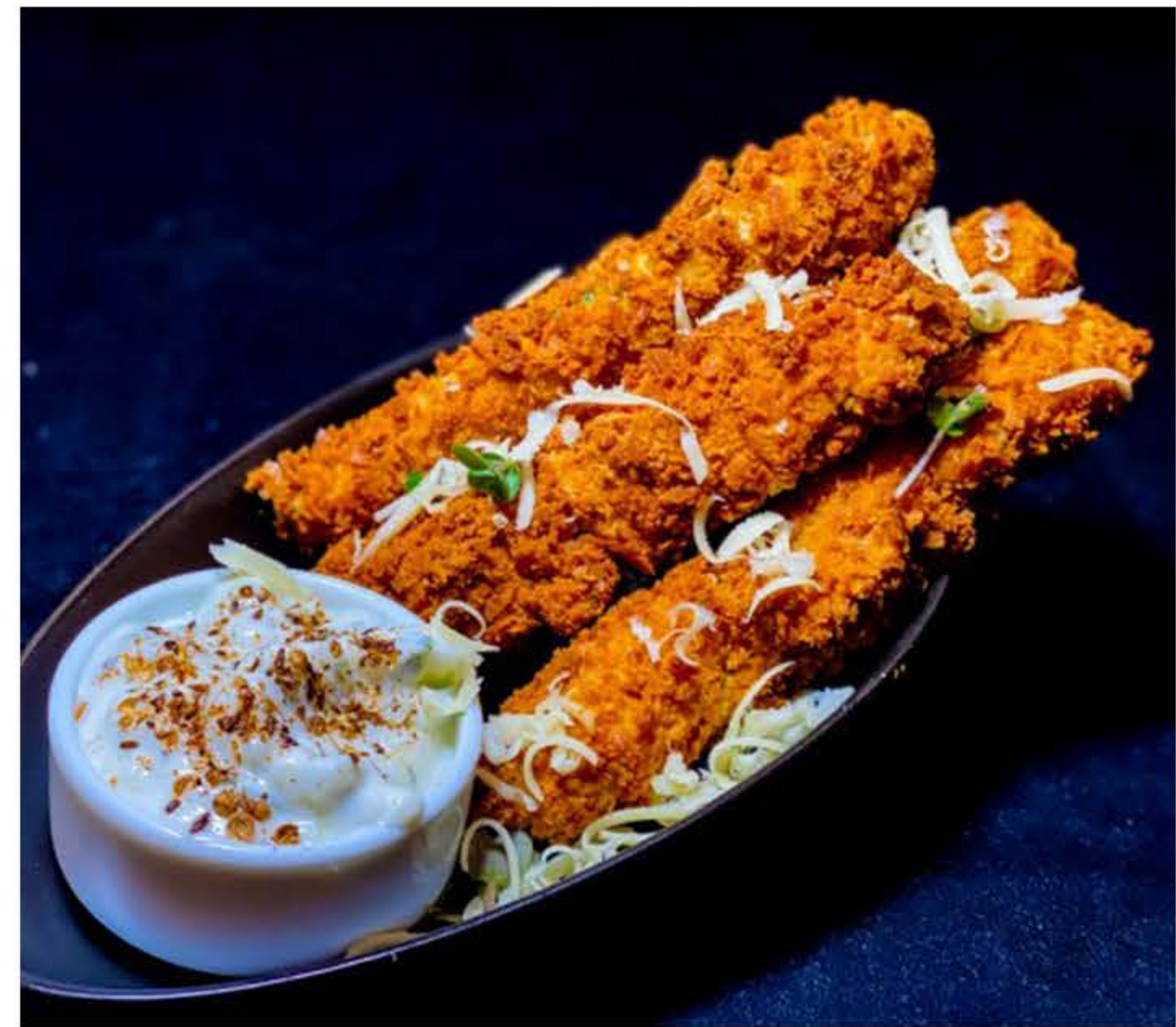
Fritto misto R70 marrow fries with a CBD cumin & coriander tzatziki