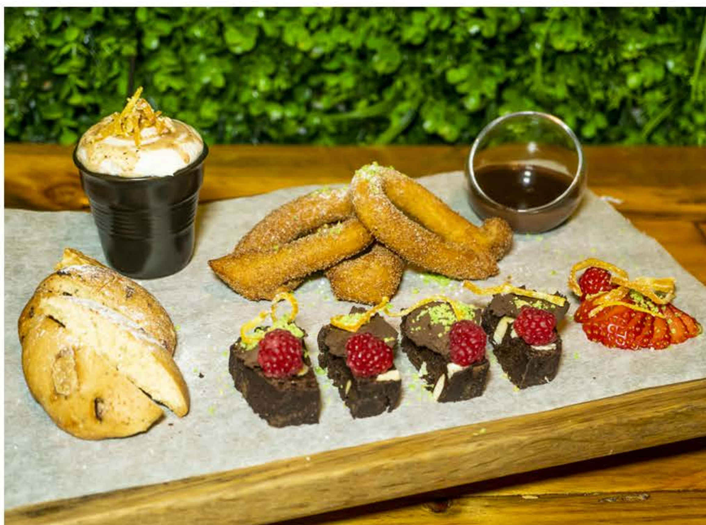
The Sweet tooth R200

2 finger ribs, king cross satays, lamb kifka with chips